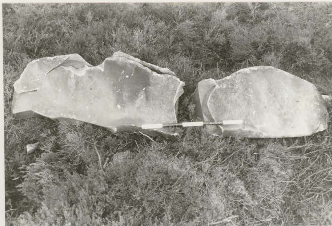
Plate 106. The broken lintel.