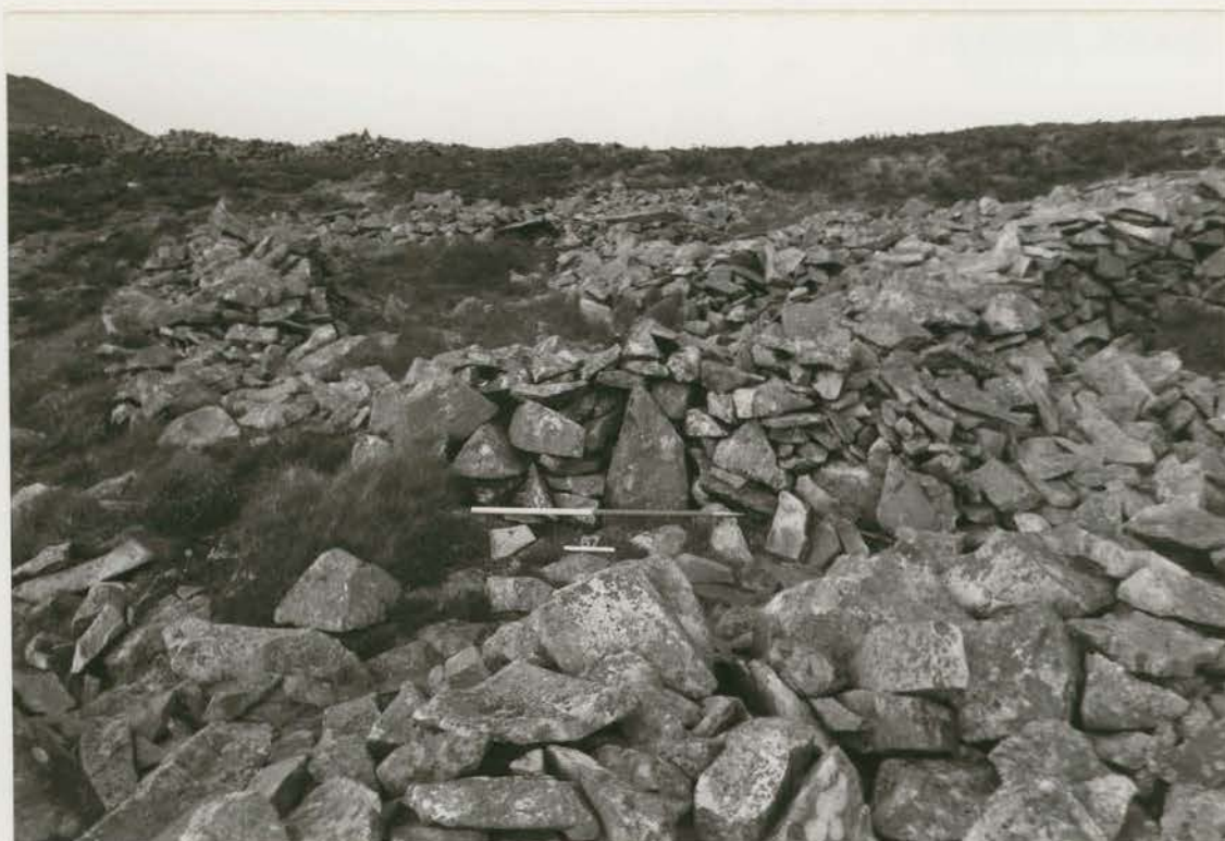
Plate 63. Hut 87: outer face of S wall before conservation, looking N (G1022/004/16).