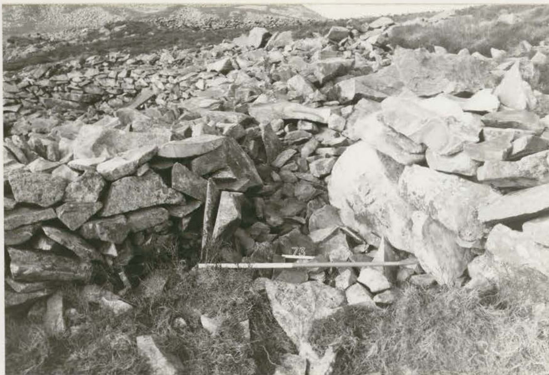
Plate 53. Hut 73: NW entrance re-opened, looking NW (G1022/022/14A).