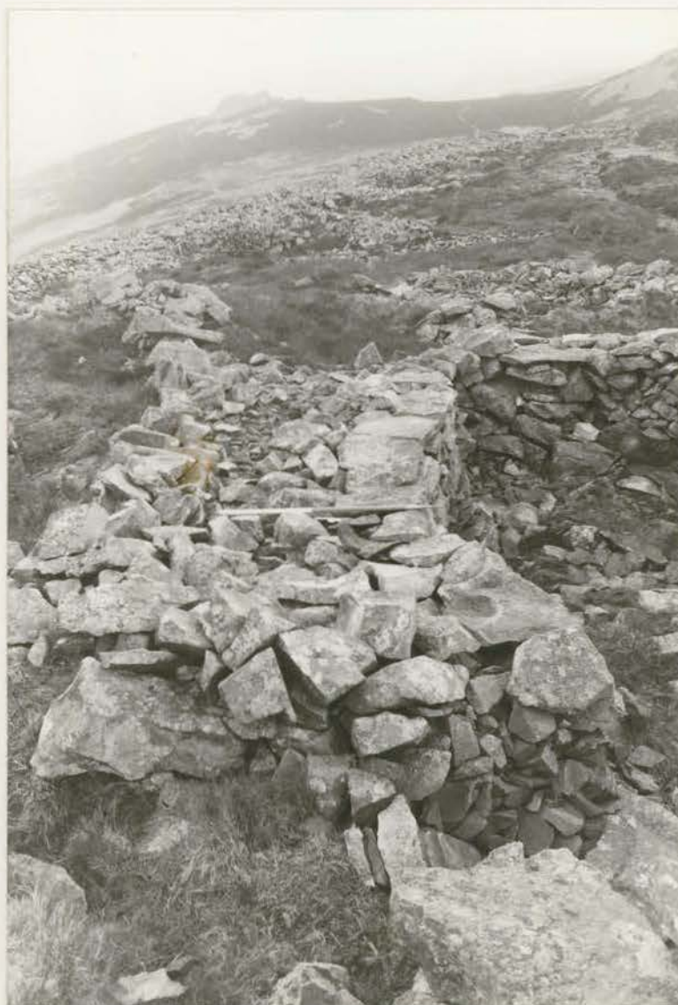
Plate 34. Wall between huts 72 & 92 after conservation, looking SW (G1022/022/15A).