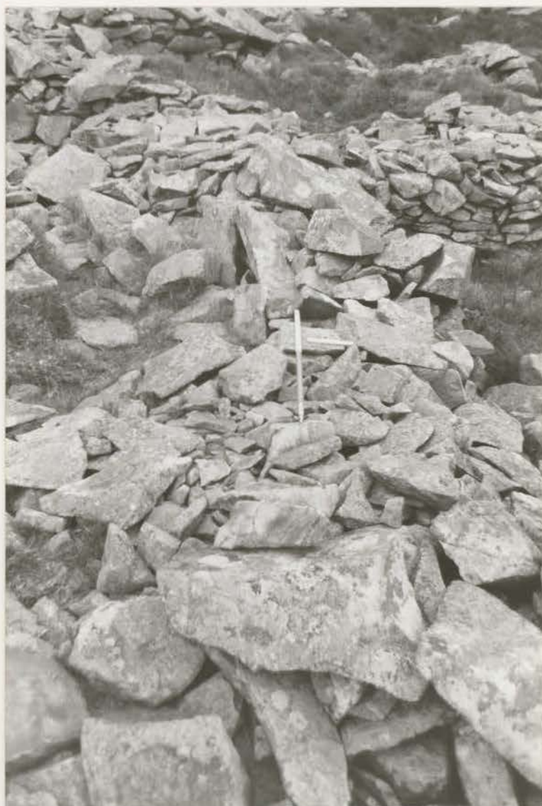
Plate 6. Hut 86: outer face of NE wall before conservation, looking SE (G1022/003/15).