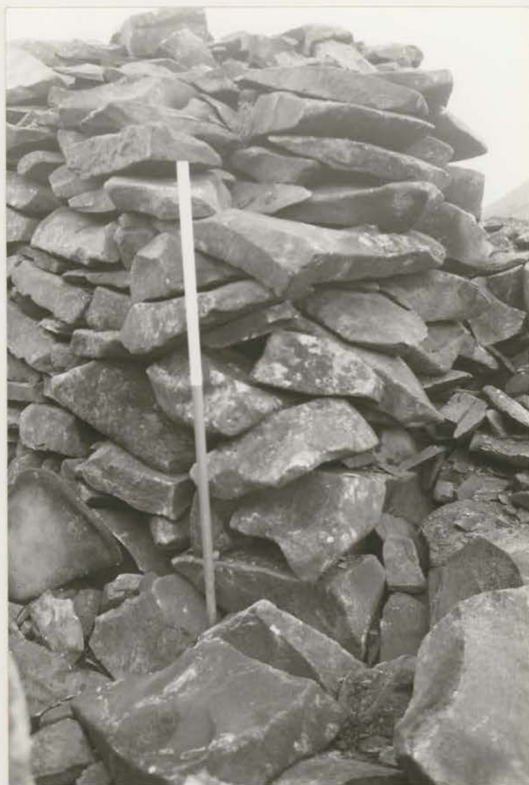
Plate 111. N postern: outer W corner before conservation, looking W (G1022/011/17A).