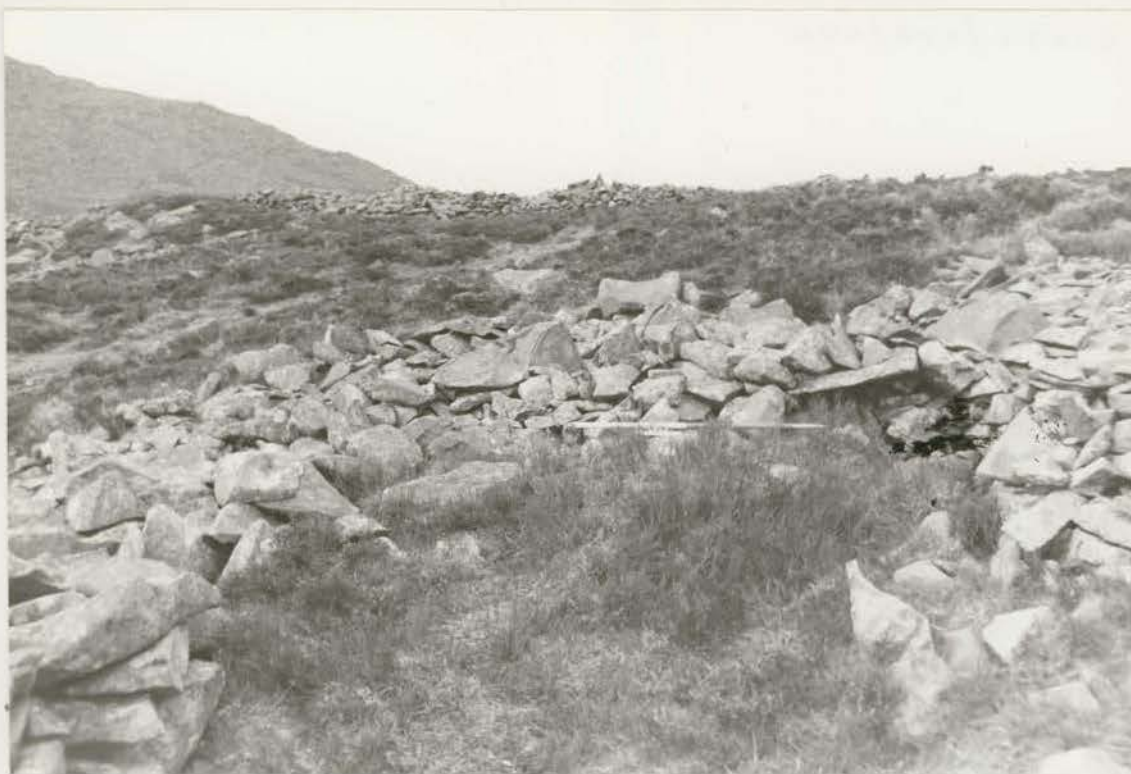
Plate 55. Hut 36: interior and NW wall before conservation, looking NW (G1022/005/09A).