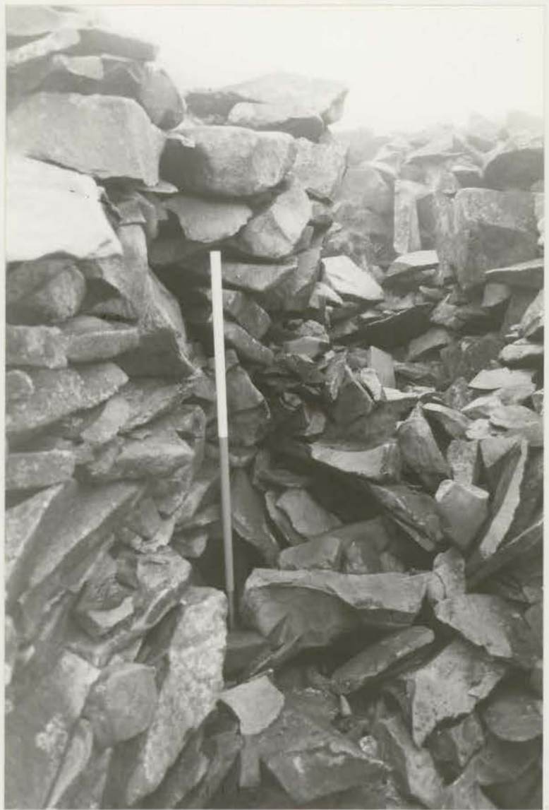
Plate 113. N postern: E side of passage before dismantling looking E (G1022/010/11).