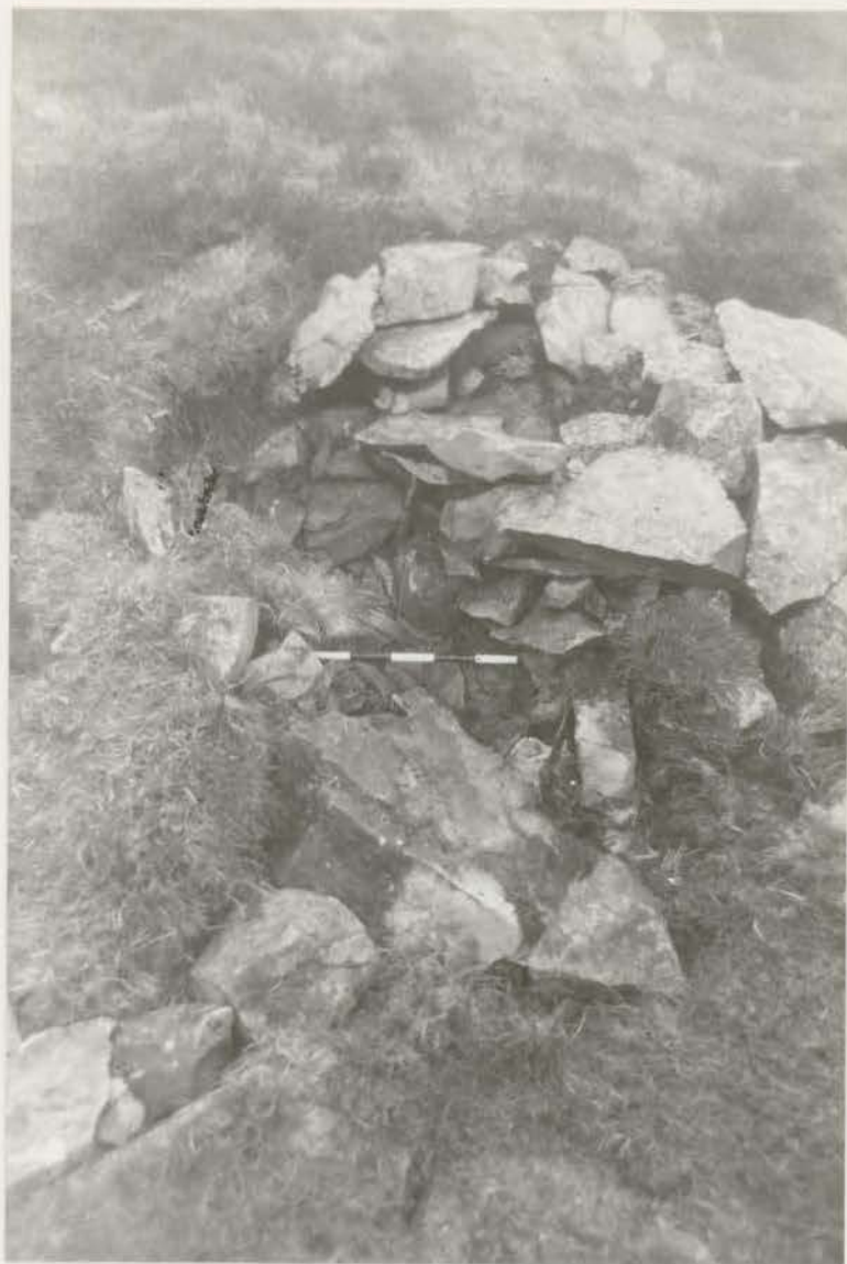
Plate 26. Hut 72: rebuilding the partition, looking SW (G1022/005/19A).