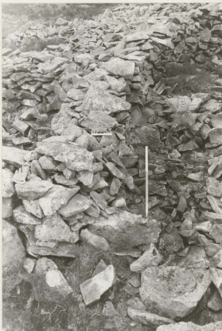
Plate 82. Hut 53: foundations of W jamb of doorway to hut 89, looking W (G1022/007/15).