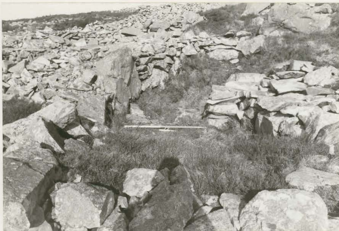
Plate 27. Hut 72 after conservation, looking NE (G1022/022/20A).