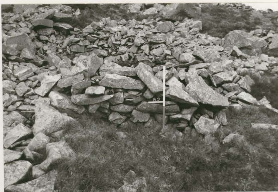
Plate 16. Hut 52: E wall before conservation, looking E (G1022/001/25).