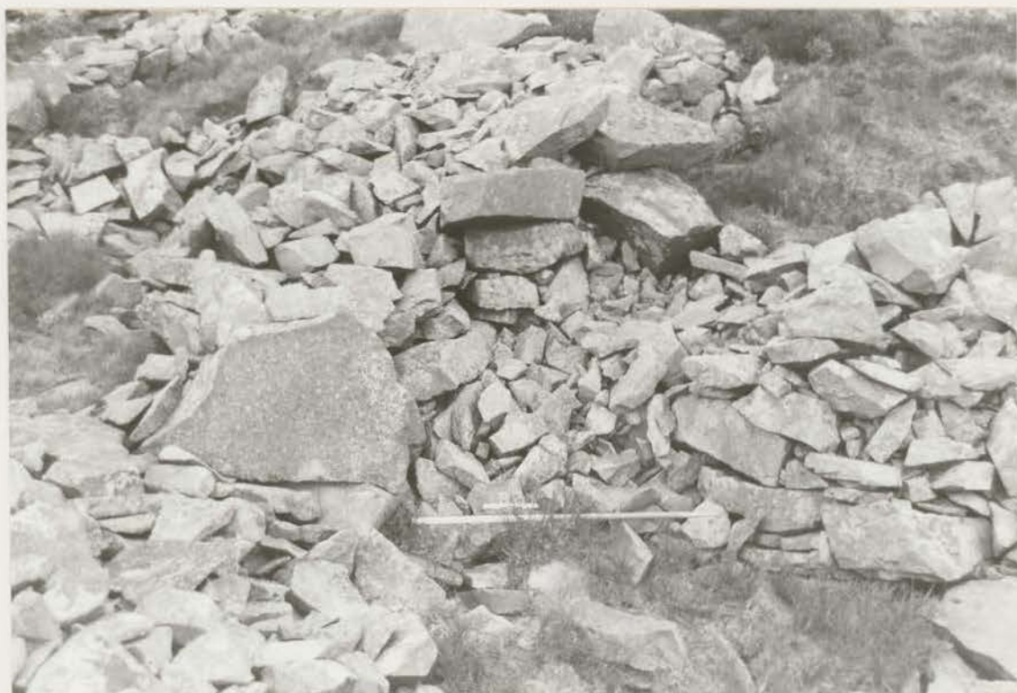
Plate 37. Hut 92: E entrance before conservation, looking E (G1022/002/06A).