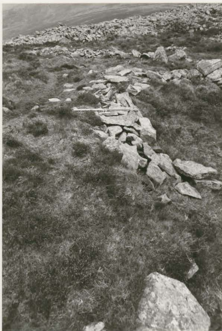
Plate 24. Hut 72: SE wall before conservation, looking SW (G1022/001/29).