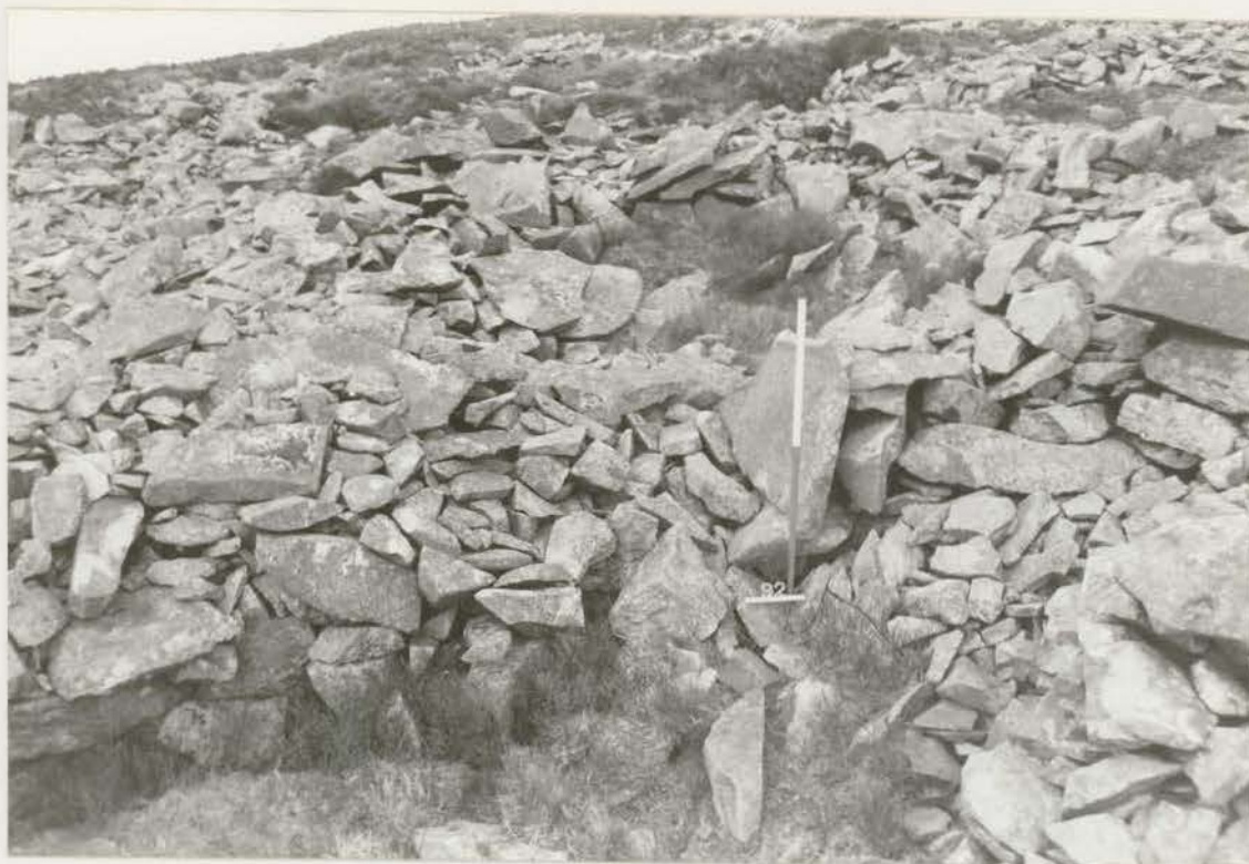
Plate 41. Hut 92: Possible N entrance before conservation, looking N (G1022/002/07A).