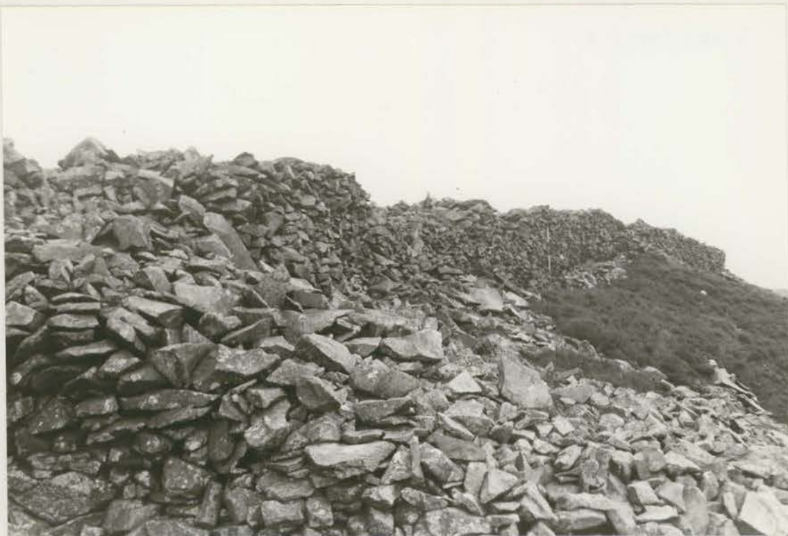
Plate 134. Outer face of rampart, with collapse 'F1' in centre, before conservation, looking S (G1022/015/13).