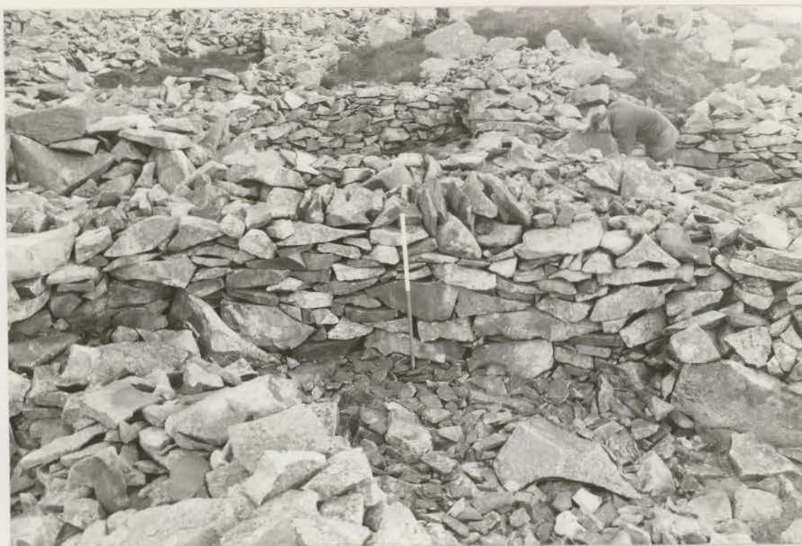
Plate 87. Hut 90; restored E wall, looking E (G1022/022/33A).