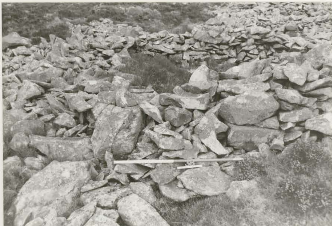
Plate 56. Hut 36: blocked entrance, looking NE (G1022/005/11A).