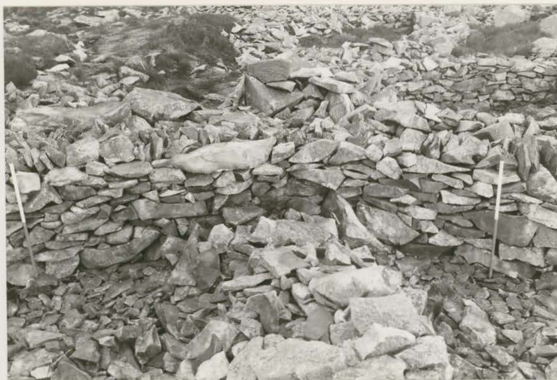
Plate 88. Huts 89 & 90: restored NE wall, looking NE (G1022/022/34A).