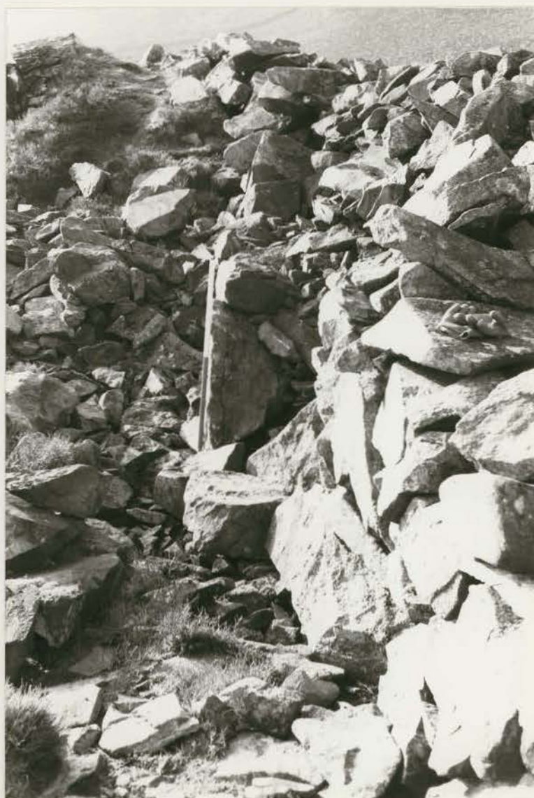
Plate 131. Collapse 'E1' after removal of tumble, looking SW (G1022/014/20).