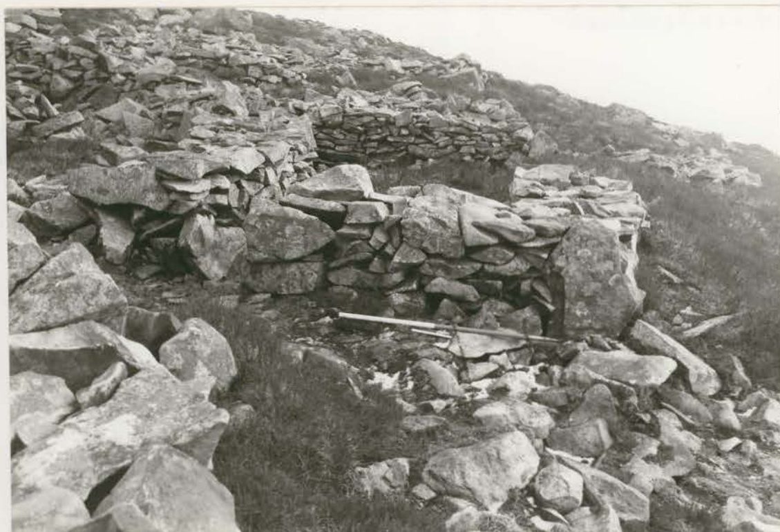
Plate 8. Hut 86 after conservation, looking SE (G1022/022/03A).