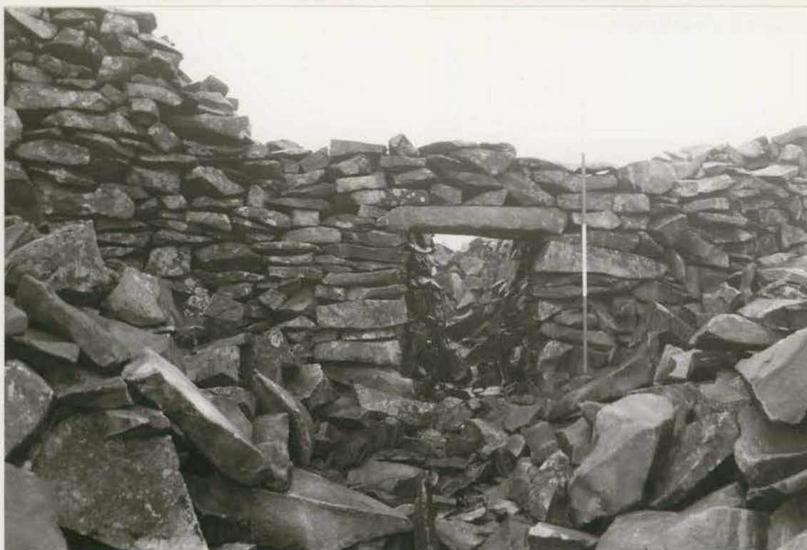
Plate 118. N postern after re-roofing, looking S (G1022/023/26).