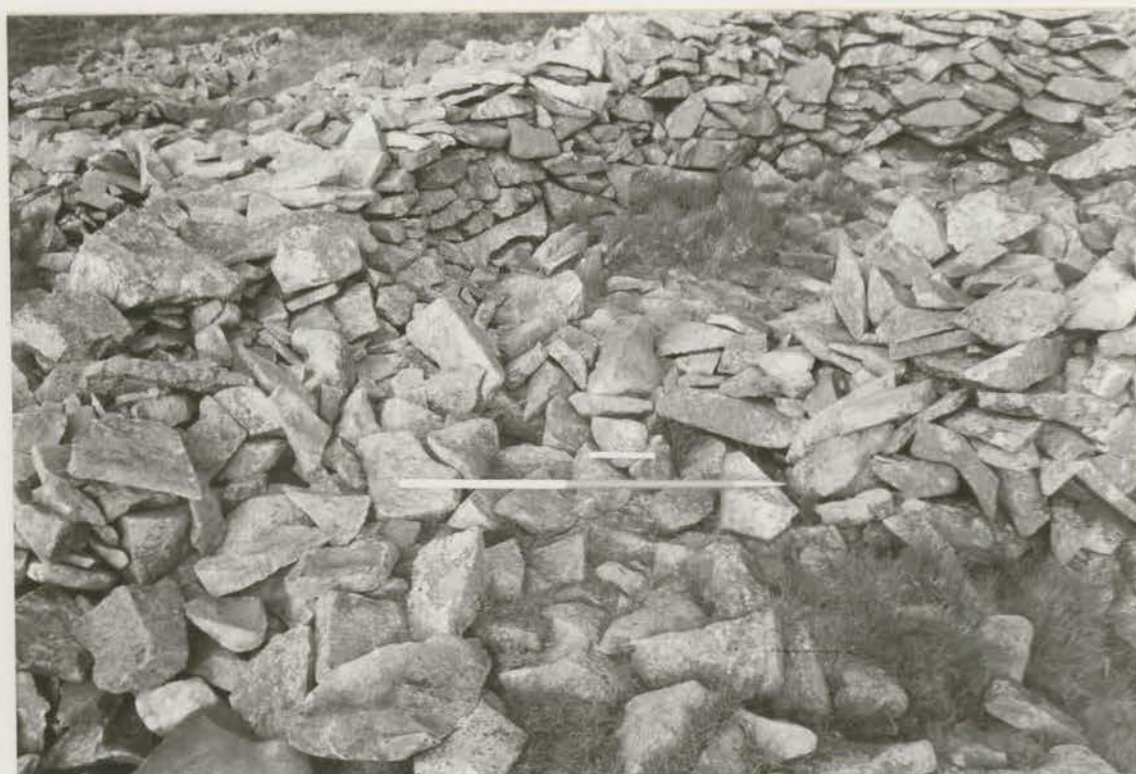
Plate 78. Hut 89: entrance from hut 53 before conservation, looking N (G1022/004/11).