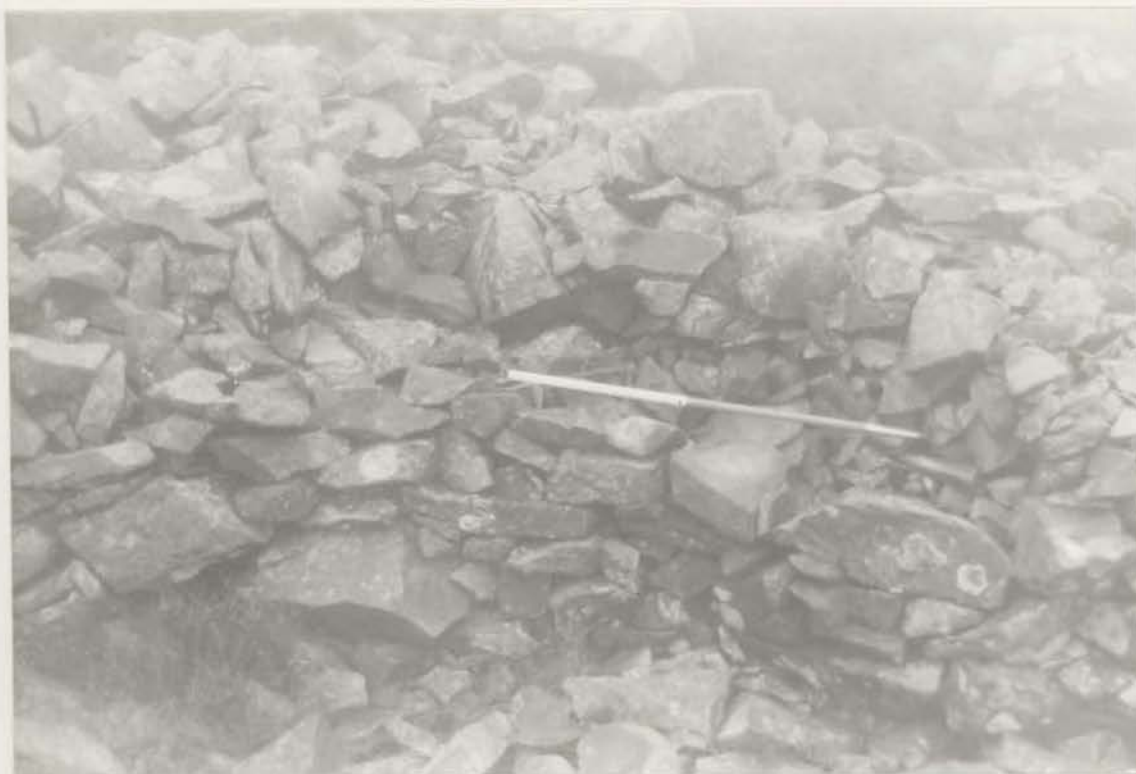
Plate 30. Hut 92: SE wall during conservation, looking SE (G1022/005/20A).