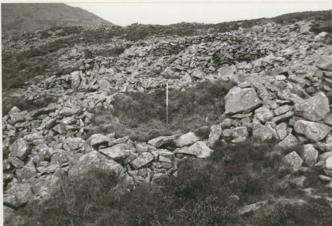
Plate 15. Hut 52 before conservation, looking NW (G1022/001/23)