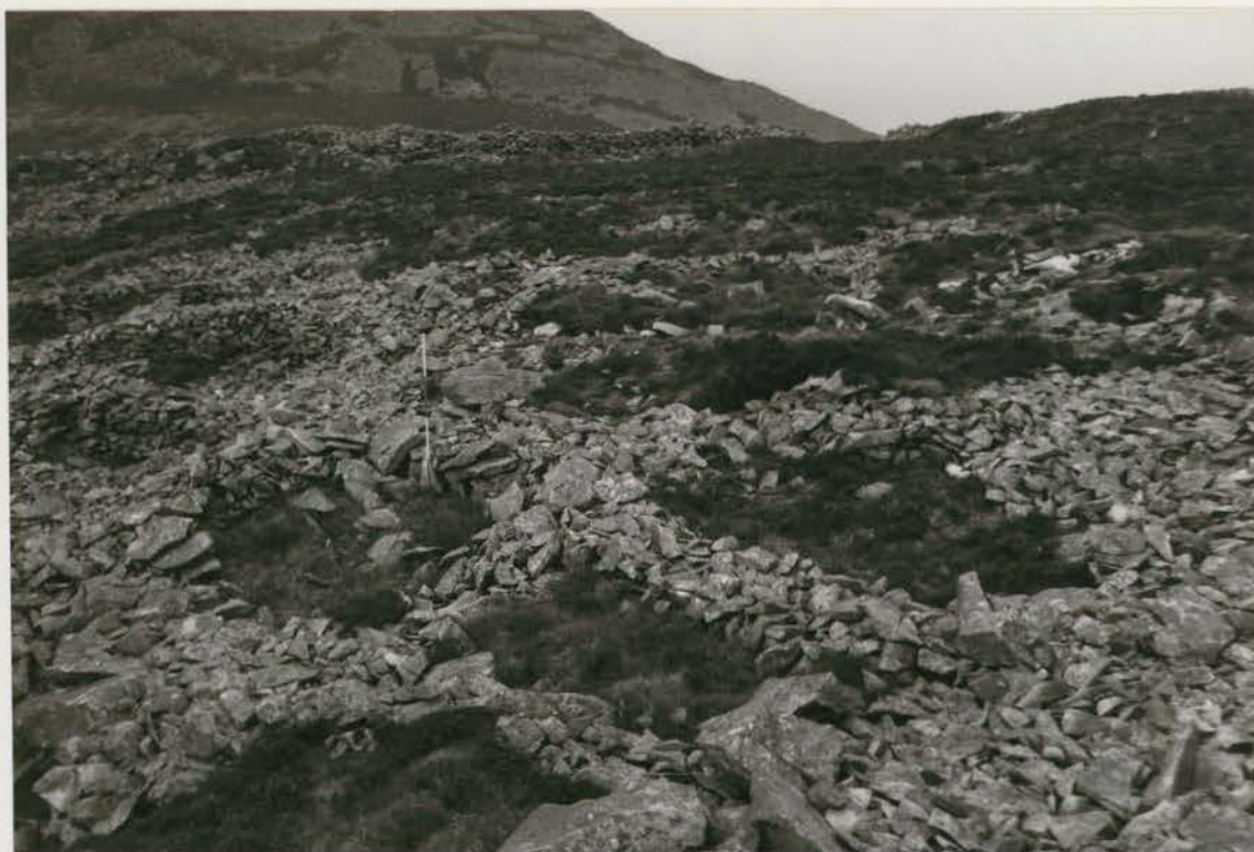
Plate 45. Hut 73 (left of centre) before conservation, looking NW (G1022/001/07).