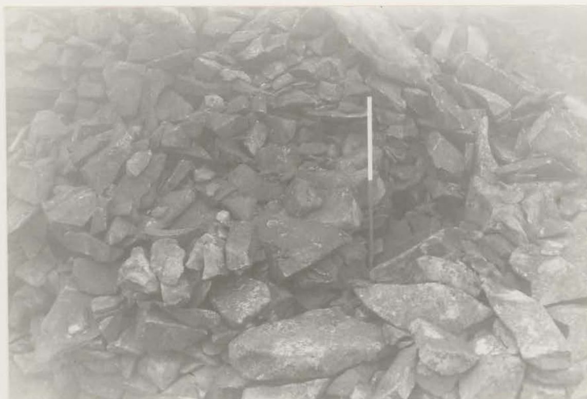
Plate 102. N postern: original inner wall face exposed to E of passage, looking E (G1022/010/12).