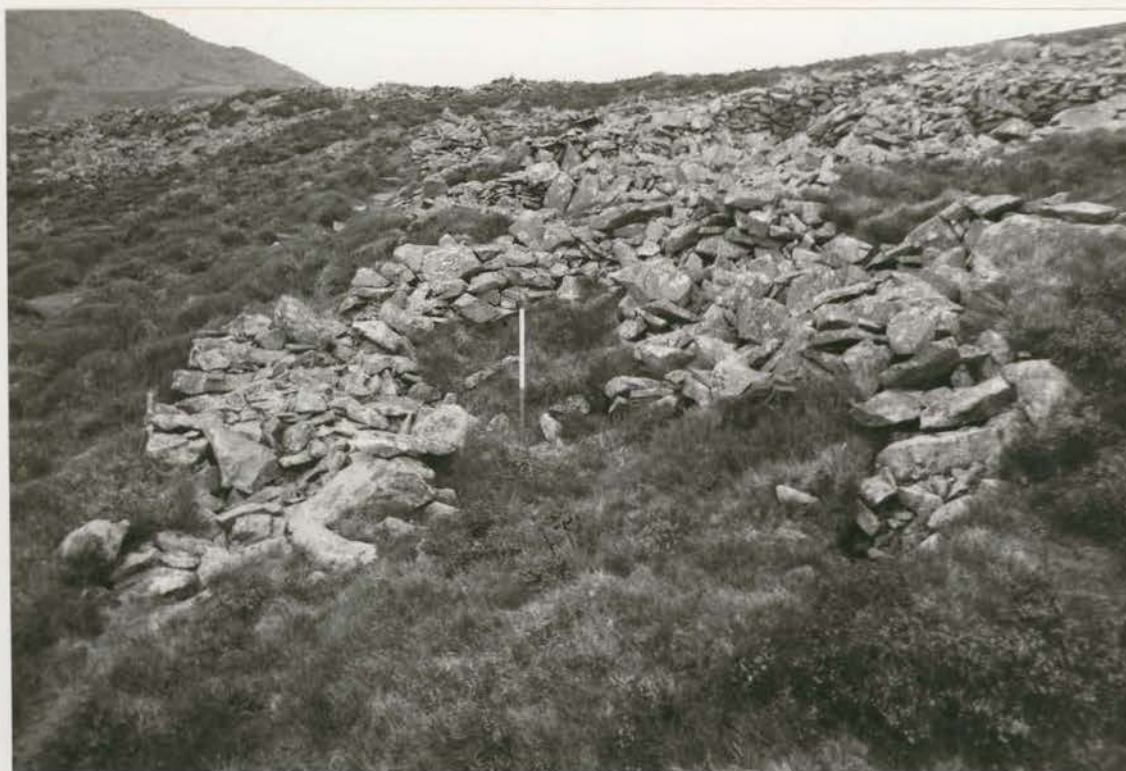
Plate 12. Hut 51 before conservation, looking NW (G1022/001/15).