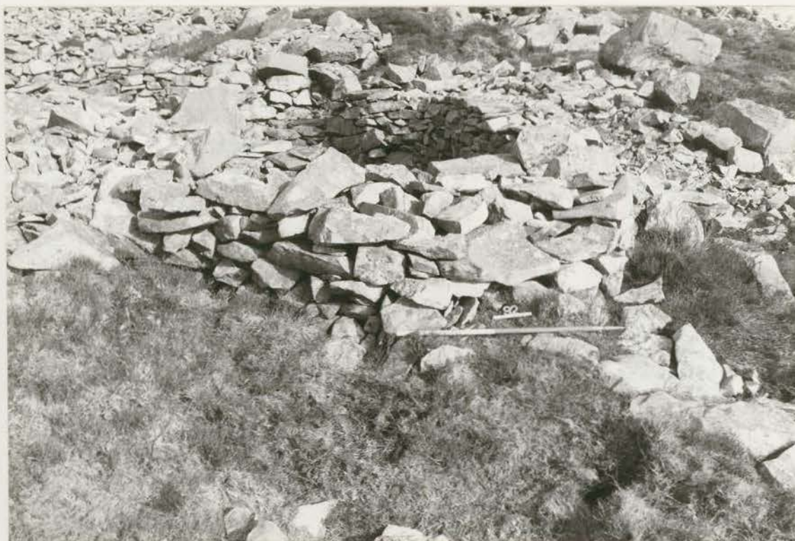
Plate 18. Hut 52: E wall after conservation, looking E (G1022/022/21A)