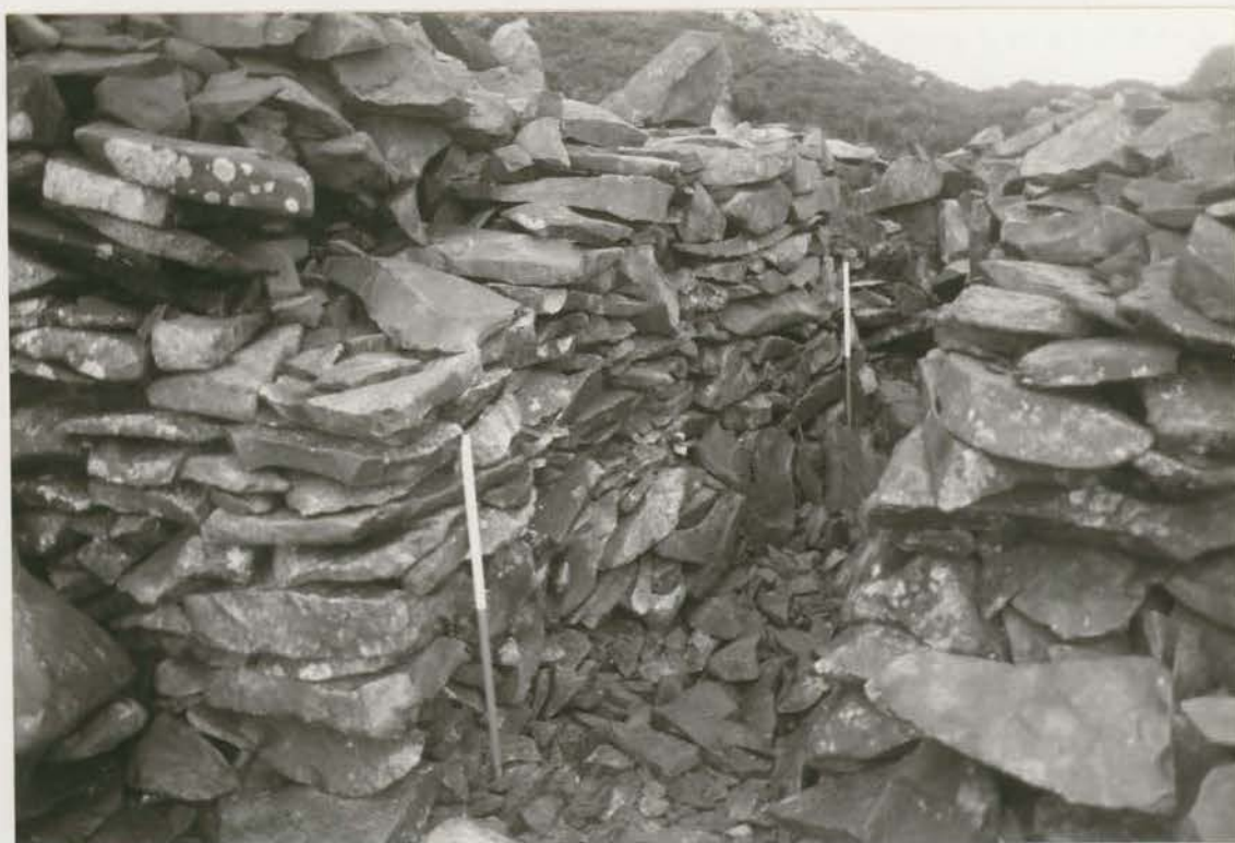
Plate 115. N postern: E side of passage after conservation, looking SE (G1022/011/06A).