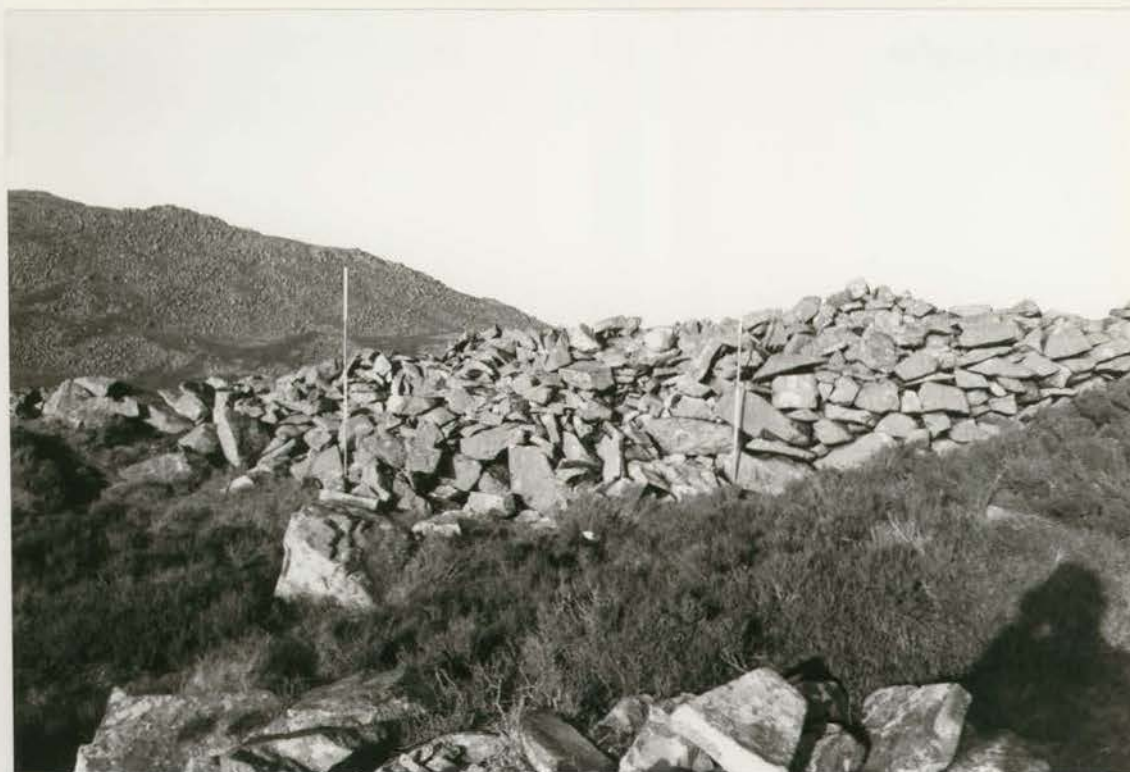
Plate 129. Collapse 'E1' before conservation, looking NW (G1022/013/12).