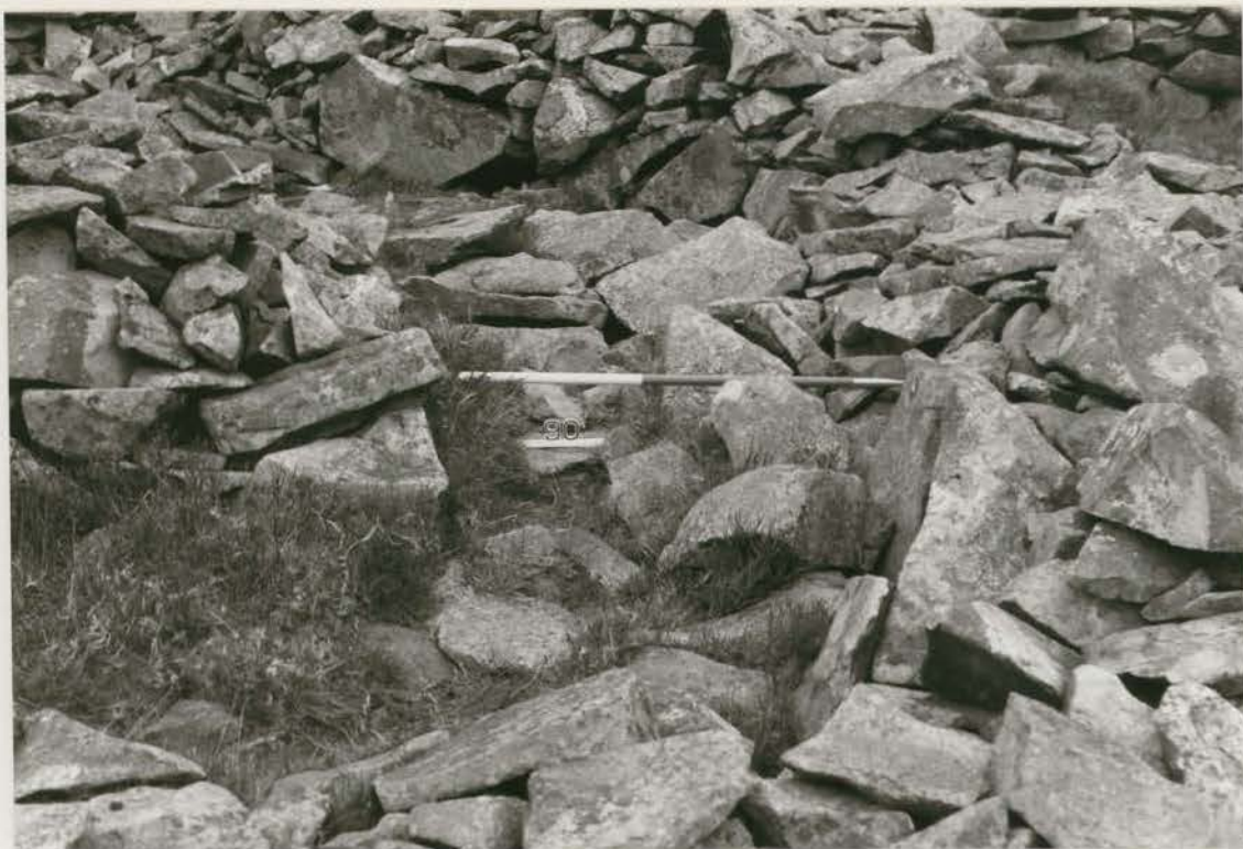
Plate 77. Hut 90: entrance from hut 53 before conservation, looking E (G1022/003/08).