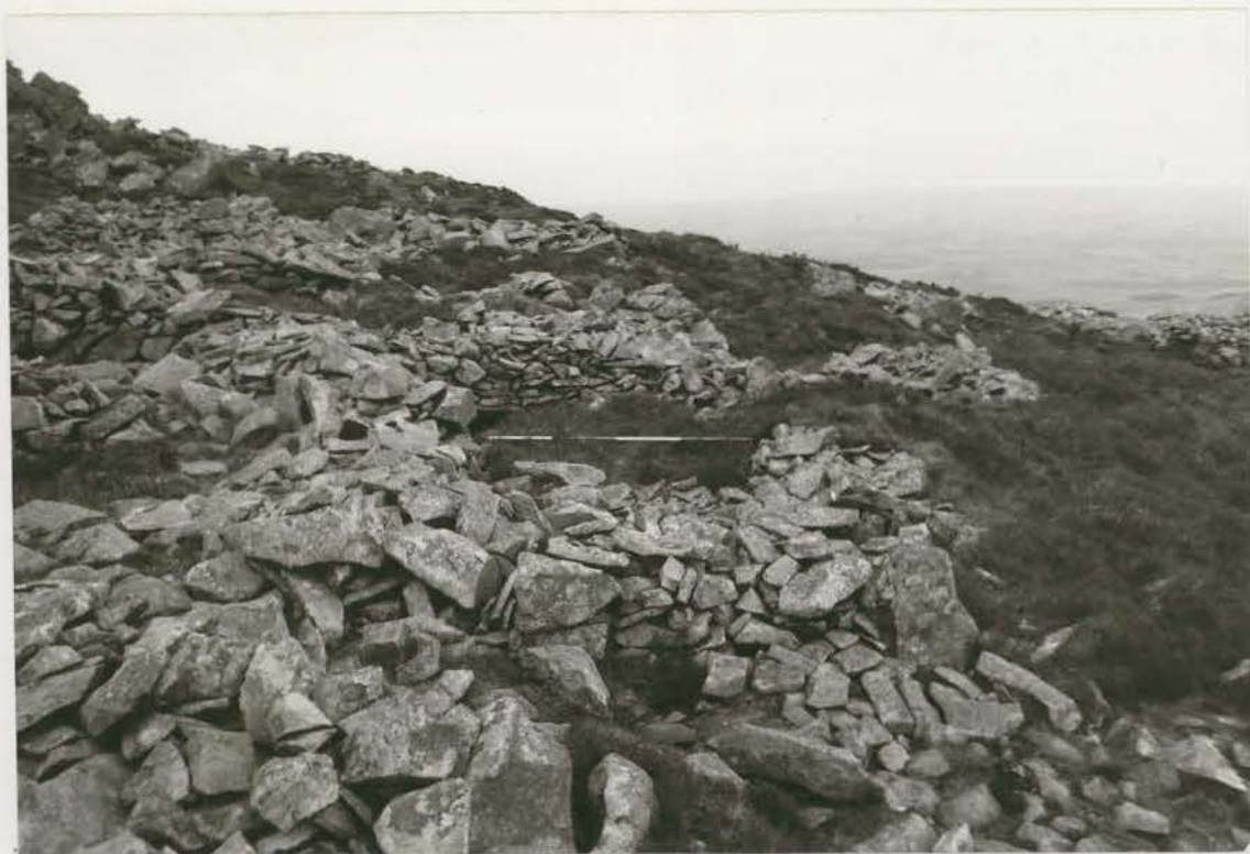
Plate 1. Hut 86 before conservation, looking SE (G1022/001/08).