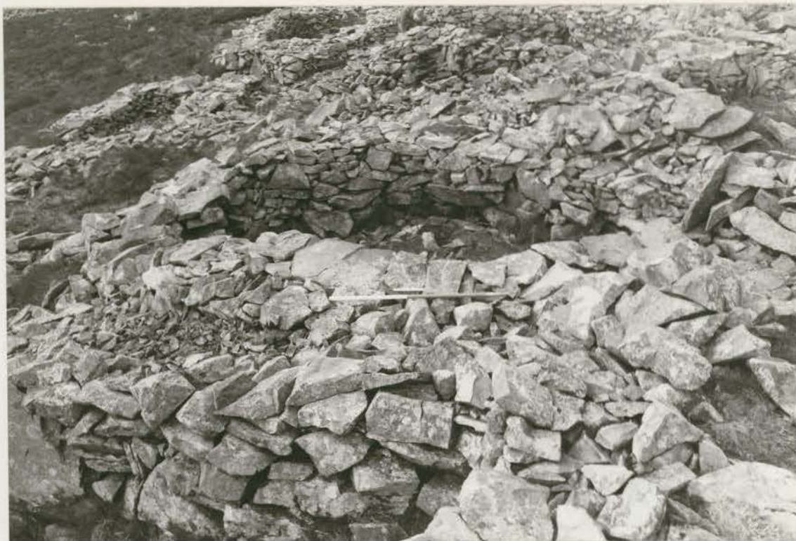
Plate 33. Wall between huts 72 & 92 after conservation, looking W (G1022/022/17A).