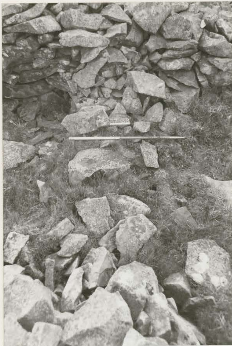
Plate 58. Hut 36: entrance cleared, looking NE (G1022/022/12A).