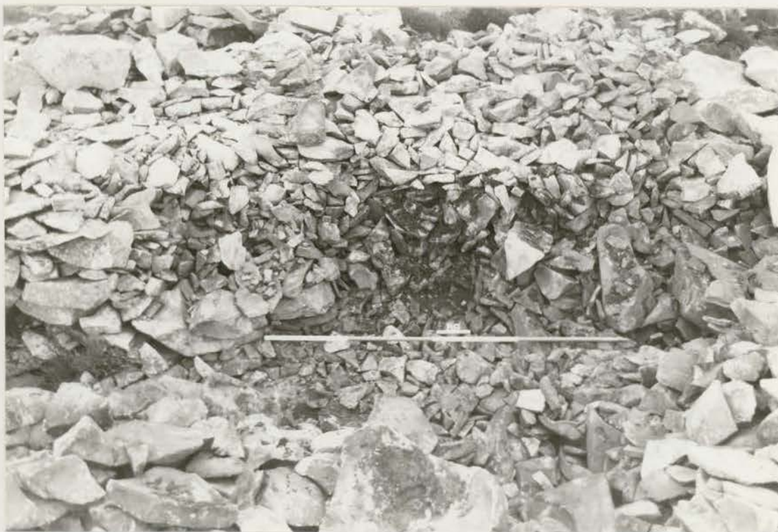
Plate 84. Hut 89: base of NE wall after removal of collapse, looking NE (G1022/015/36).