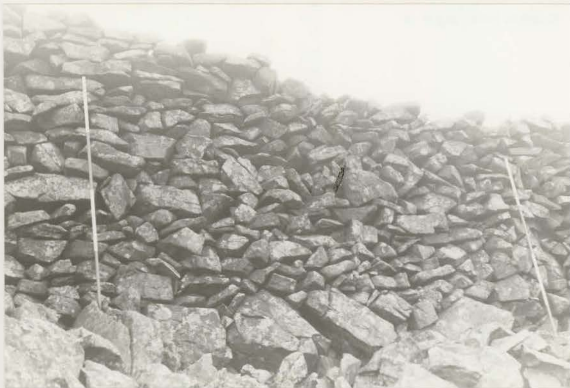
Plate 94. Inner rampart, length D - E, showing changes in construction (G1022/016/31A).