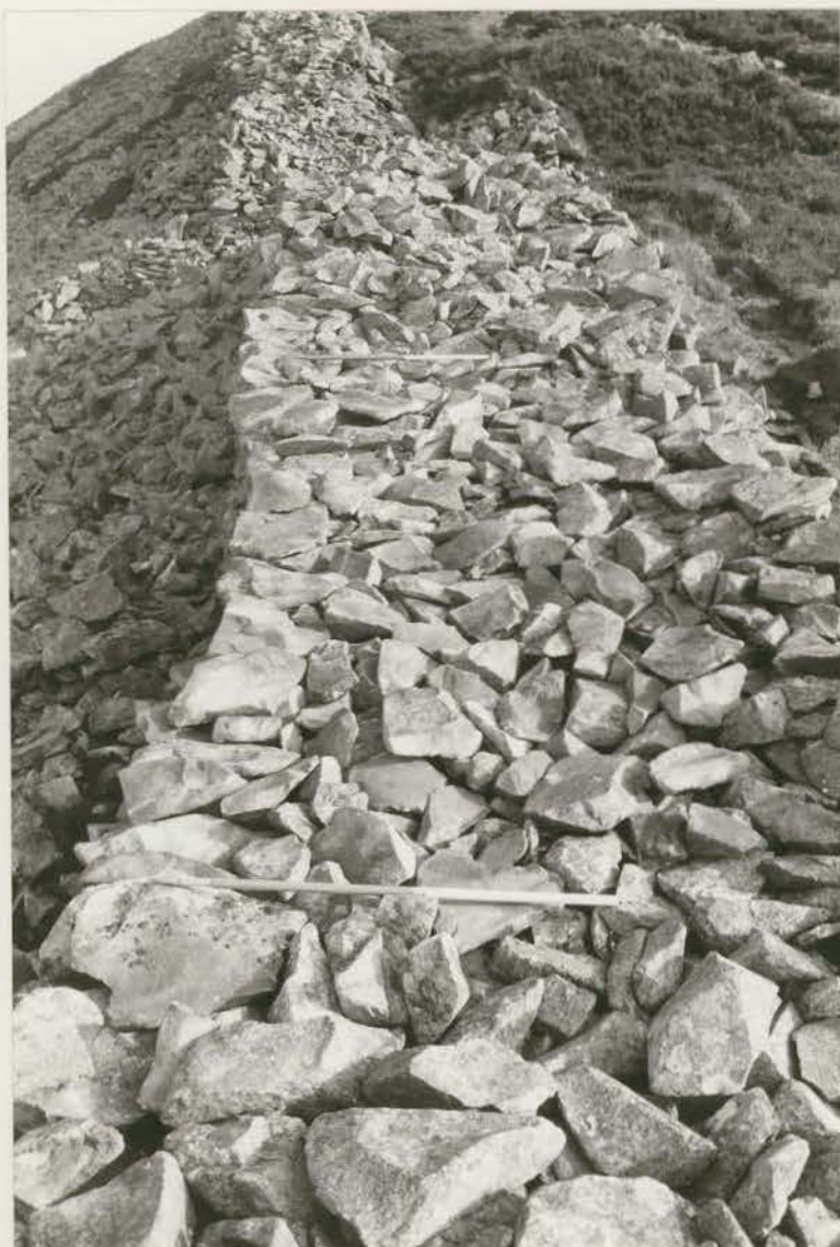
Plate 136. Collapse 'F1': top of wall after conservation, looking NE (G1022/023/18).