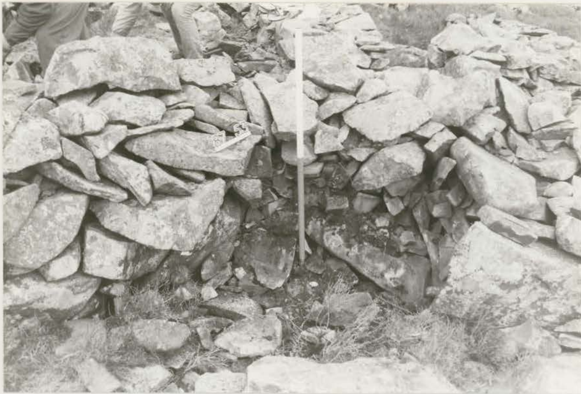
Plate 67. Hut 87: SE corner after removal of collapse, with original outer face of hut 53 exposed, looking SE (G1022/007/13).