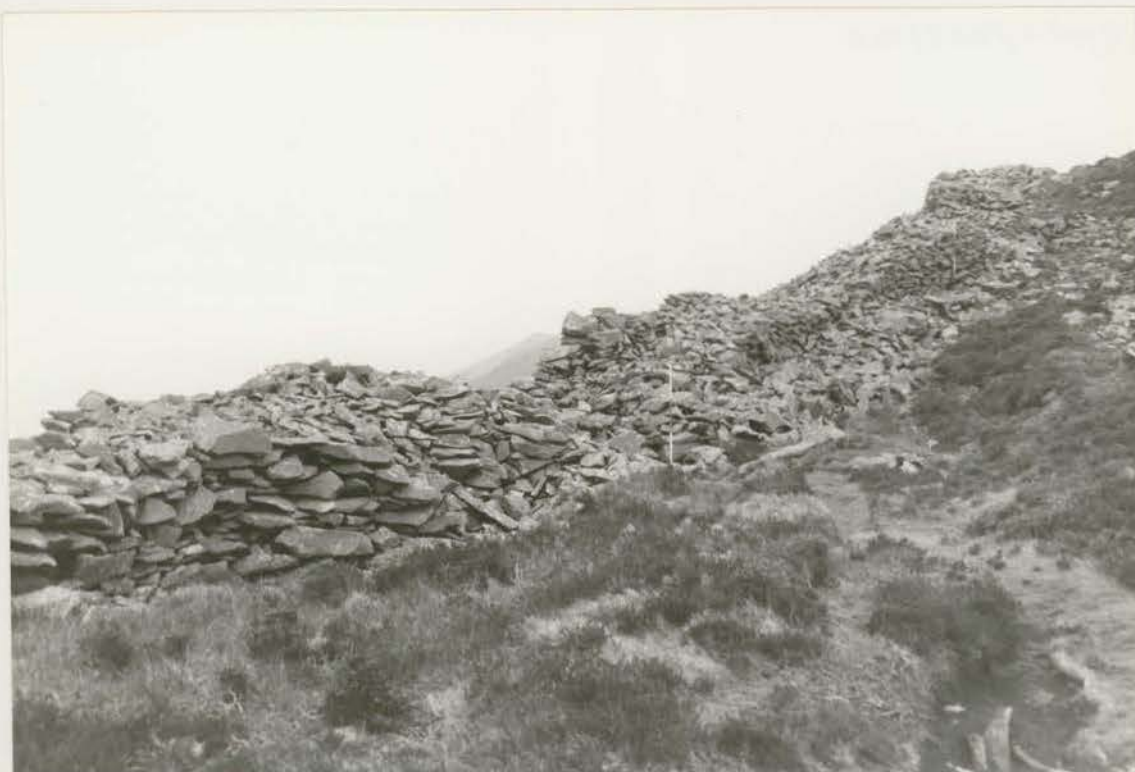
Plate 99. N postern and 'ramp': general view before conservation, looking NE (G1022/008/14A).