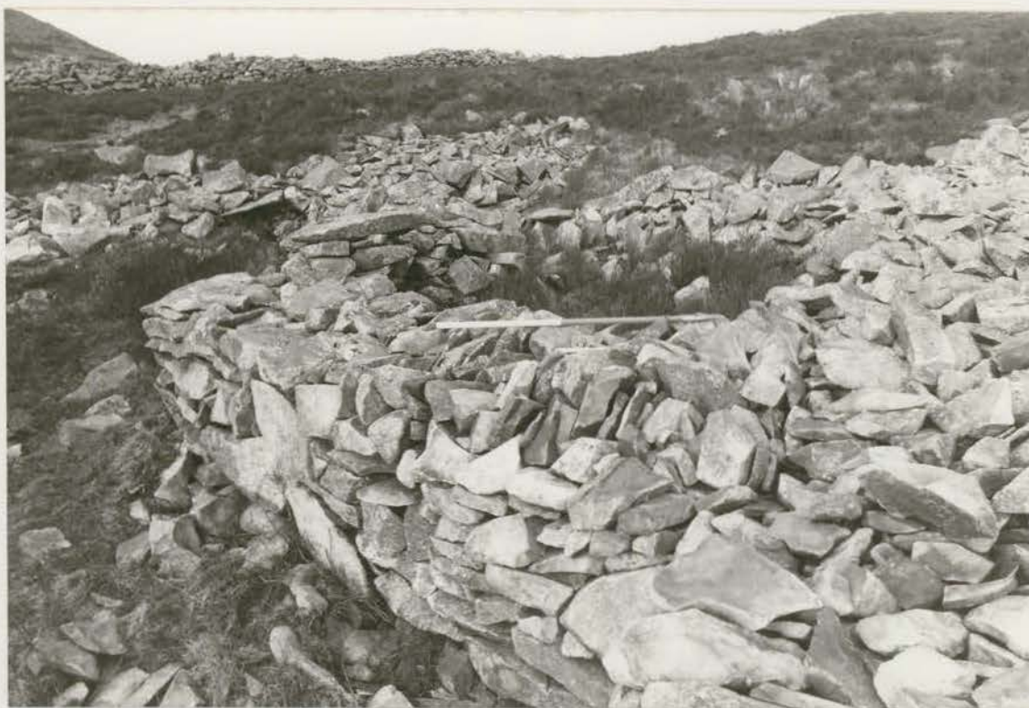
Plate 92. Hut 87: NE wall with experimental capping, looking NW (G1022/022/08A).