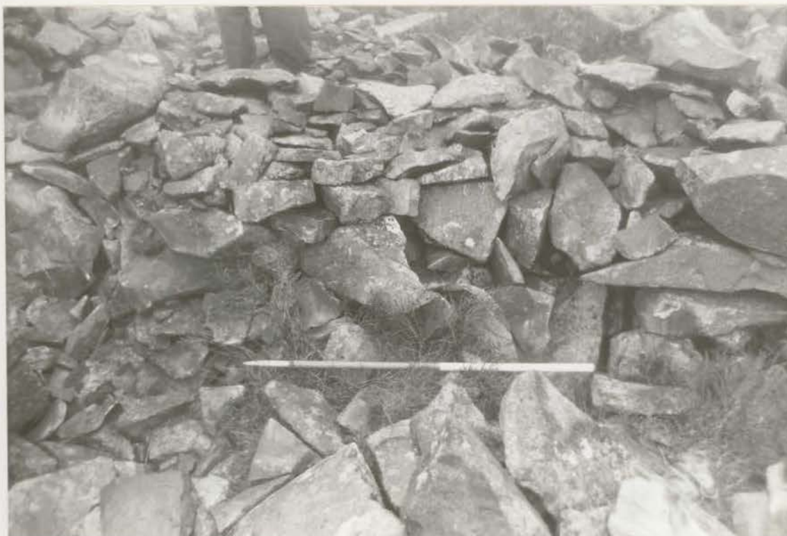
Plate 4. Hut 86: NE wall after clearance of tumbled stones, looking NE (G1022/005/12A).