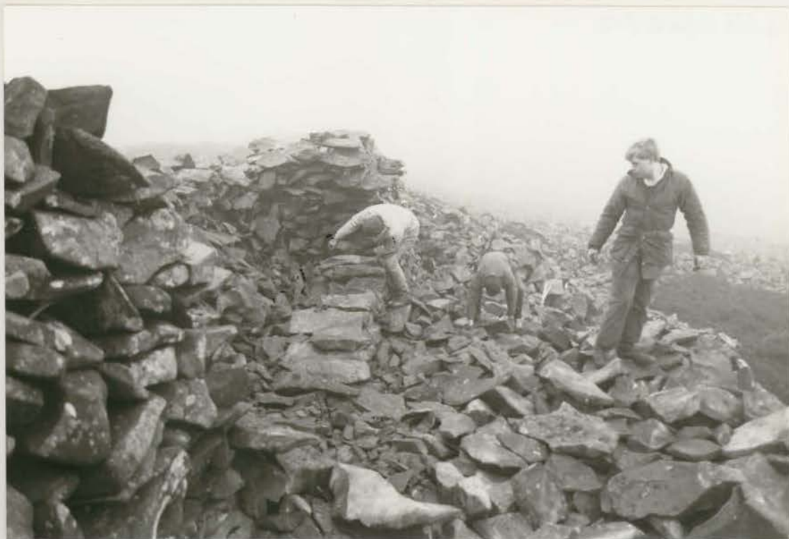
Plate 123. Collapse 'N': wall being refaced, looking W (G1022/012/12).