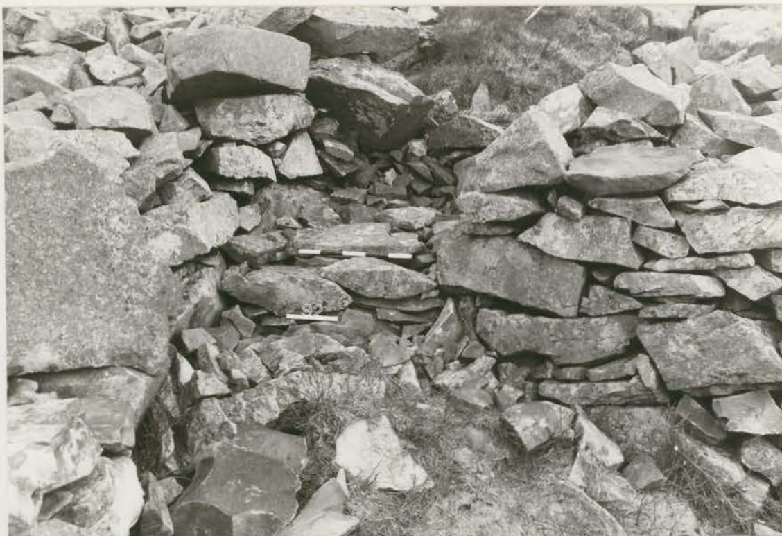
Plate 40. Hut 92. E entrance after conservation, looking E (G1022/021/28).