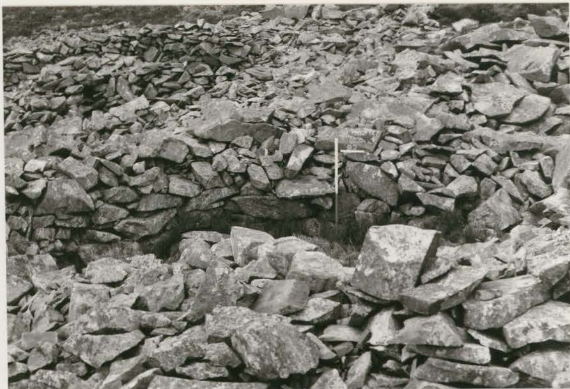
Plate 35. Hut 92: NW wall before conservation, looking NW (G1022/001/36).