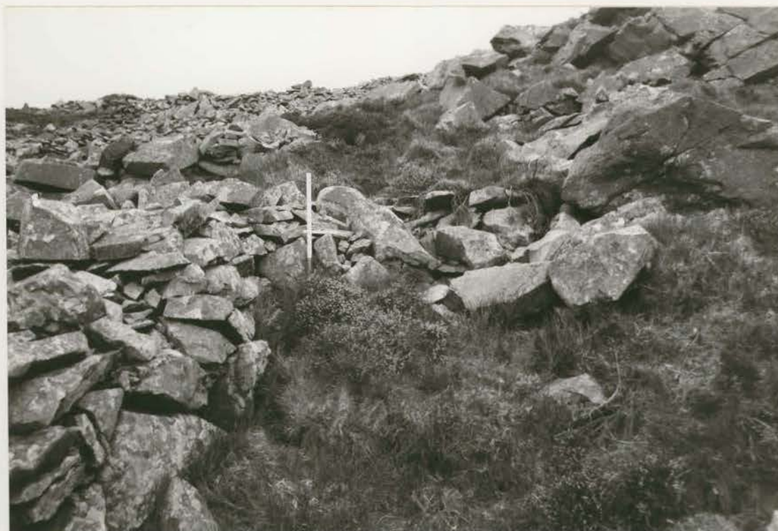
Plate 20. Hut 72: NE wall before conservation, looking NE (G1022/001/30).