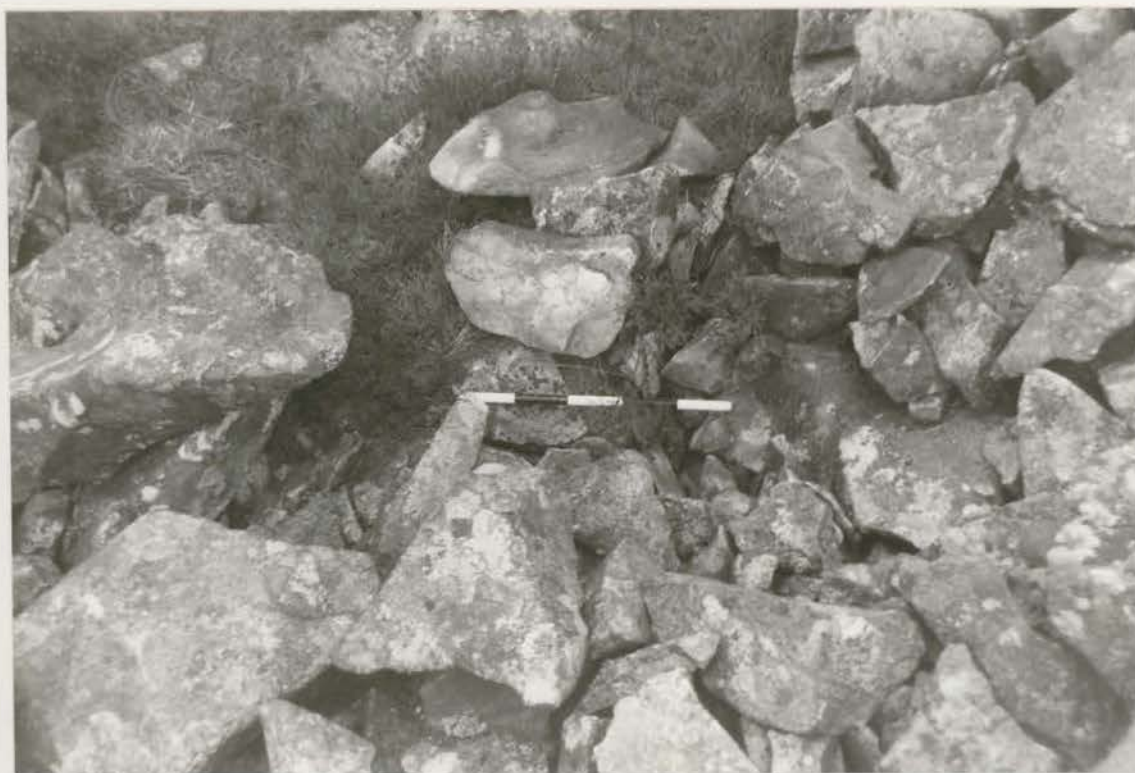
Plate 14. Hut 51, N corner: facing stones revealed (G1022/005/16A).