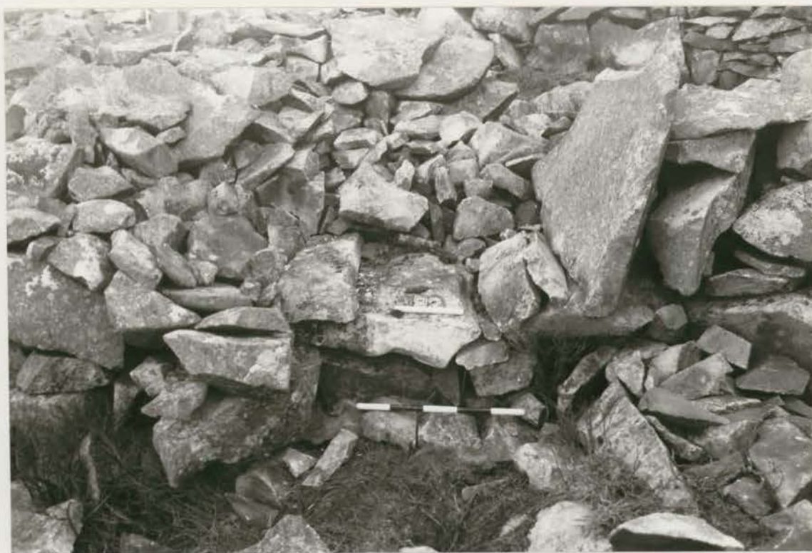
Plate 44. Hut 92: Possible N entrance after conservation, looking N (G1022/022/35A).