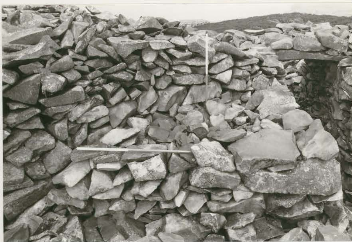
Plate 104. N postern: original inner wall face exposed to W of passage, looking N (G1022/023/29).