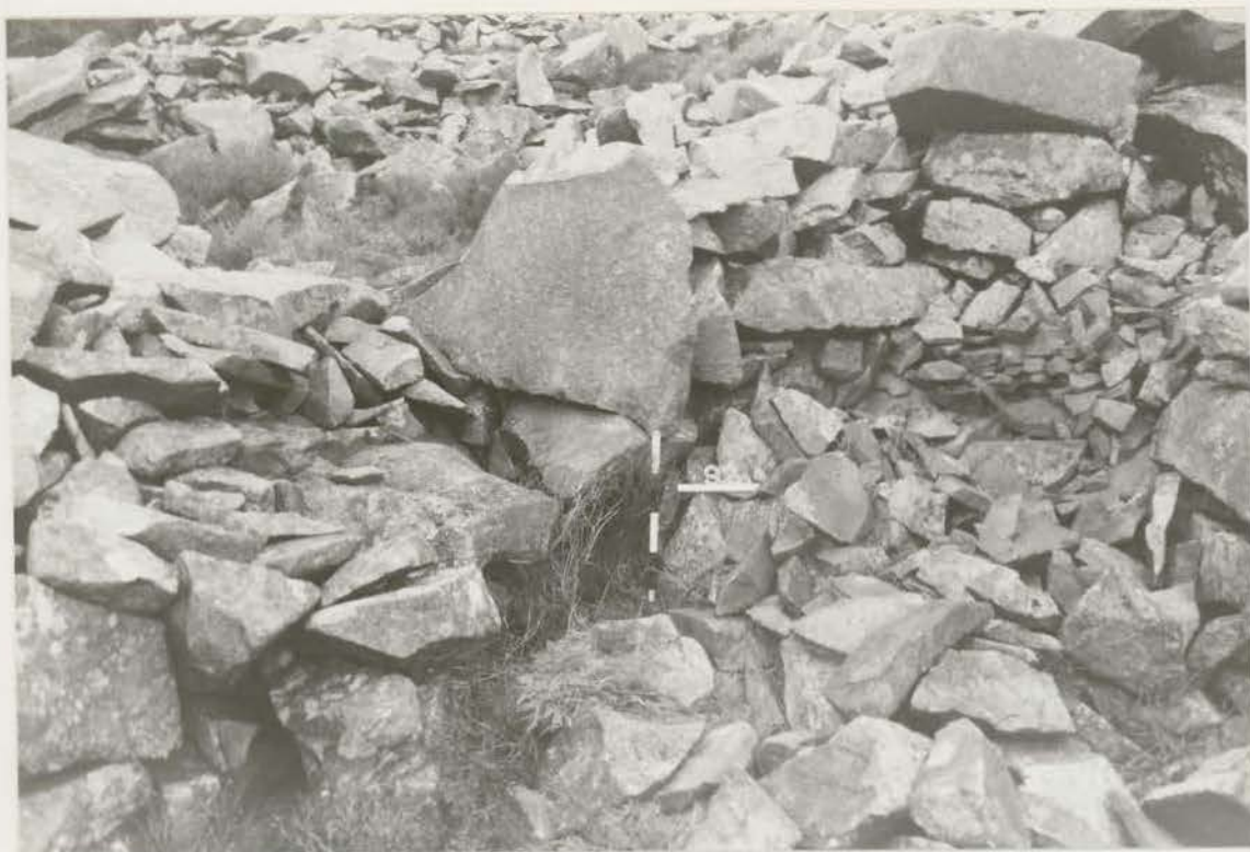
Plate 43. Hut 92: rubble cleared from possible N entrance, looking NE (G1022/005/23A).