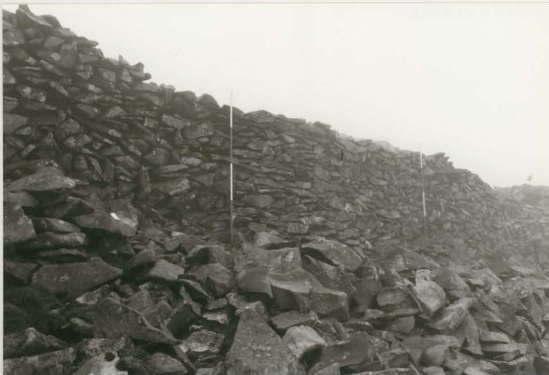
Plate 125. Collapse 'N' after conservation, looking SW (G1022/023/24).