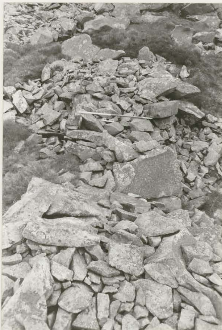
Plate 42. Wall between huts 92 & 73 before conservation, looking E (G1022/002/17A).