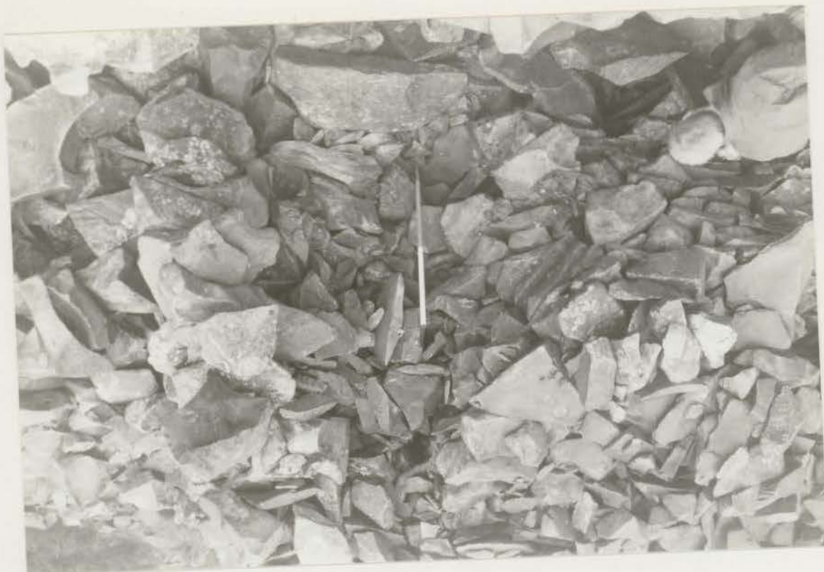
Plate 114. N postern: E side of passage after dismantling, with original inner wall face exposed, looking E (G1022/010/20).