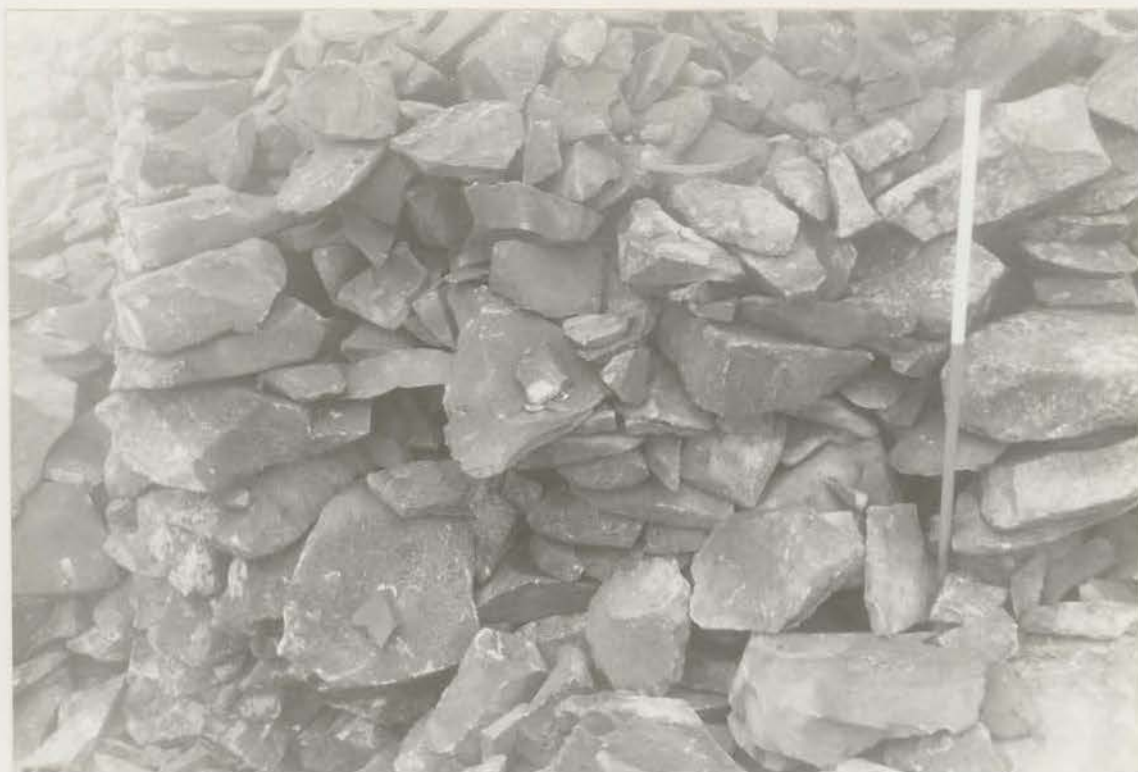
Plate 103. N postern: E side of passage partly cleared, looking E (G1022/010/10).