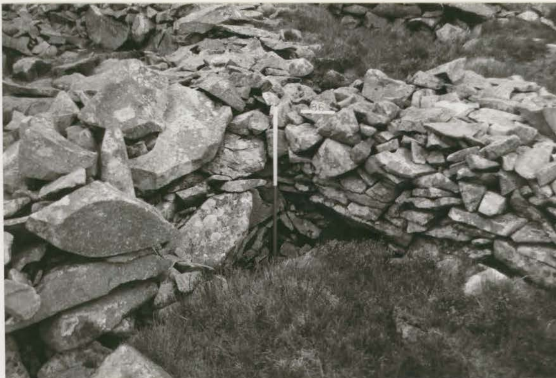
Plate 3. Hut 86: E corner, before conservation (G1022/001/13).