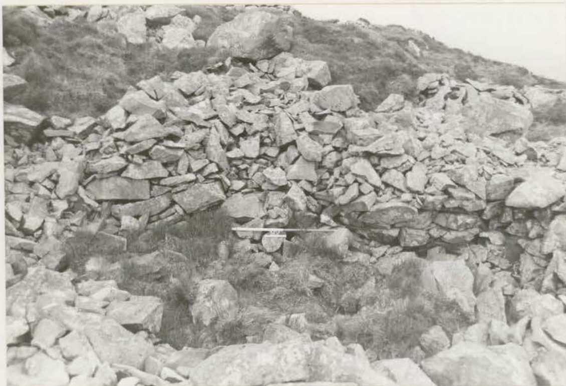
Plate 29. Hut 92: SE wall before conservation, looking SE (G1022/002/05A).