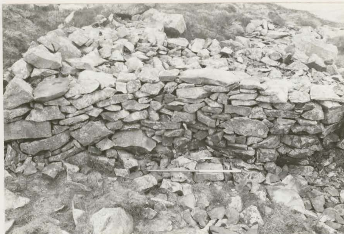
Plate 31. Hut 92: SE wall after conservation, looking SE (G1022/021/30).