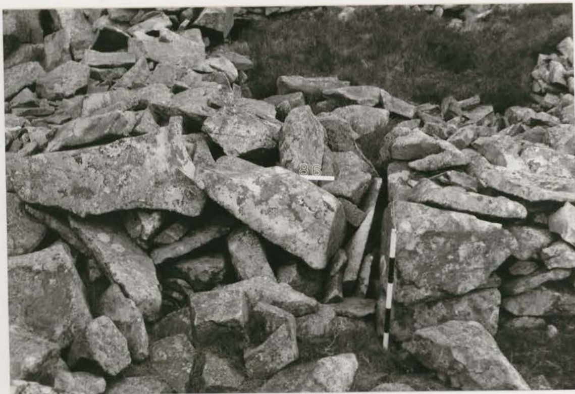
Plate 2. Hut 86: blocked entrance, looking SE (G1022/001/14).