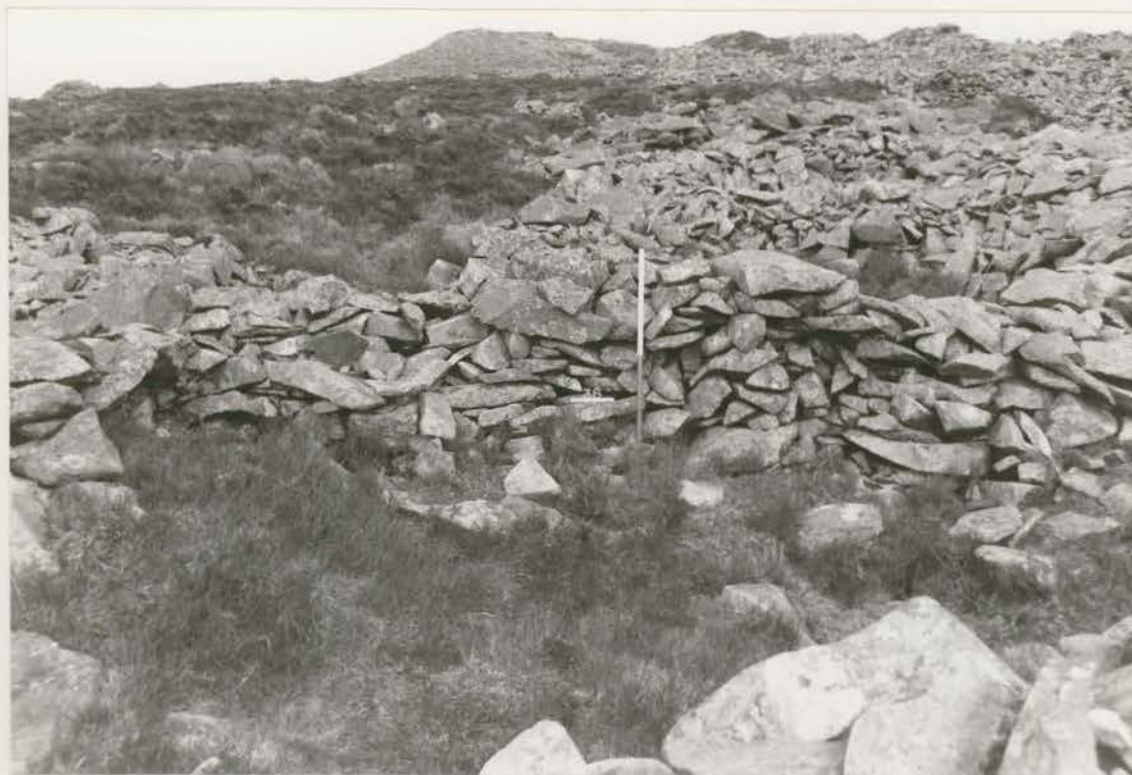
Plate 54. Hut 36: NE wall before conservation, looking NE (G1022/005/08A).