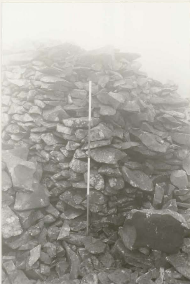
Plate 107. N postern: outer E corner of passage before dismantling, looking SE (G1022/010/06).