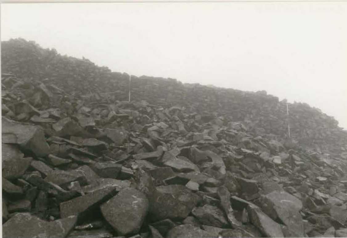
Plate 124. Collapse 'N' after conservation, looking S. Scales set as in Plate 120. (G1022/023/23).