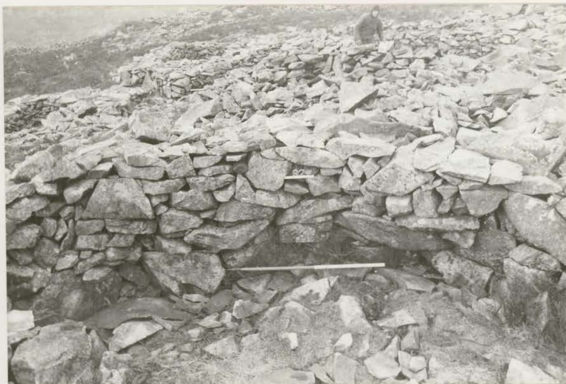
Plate 36. Hut 92: NW wall after conservation, looking NW (G1022/021/33).