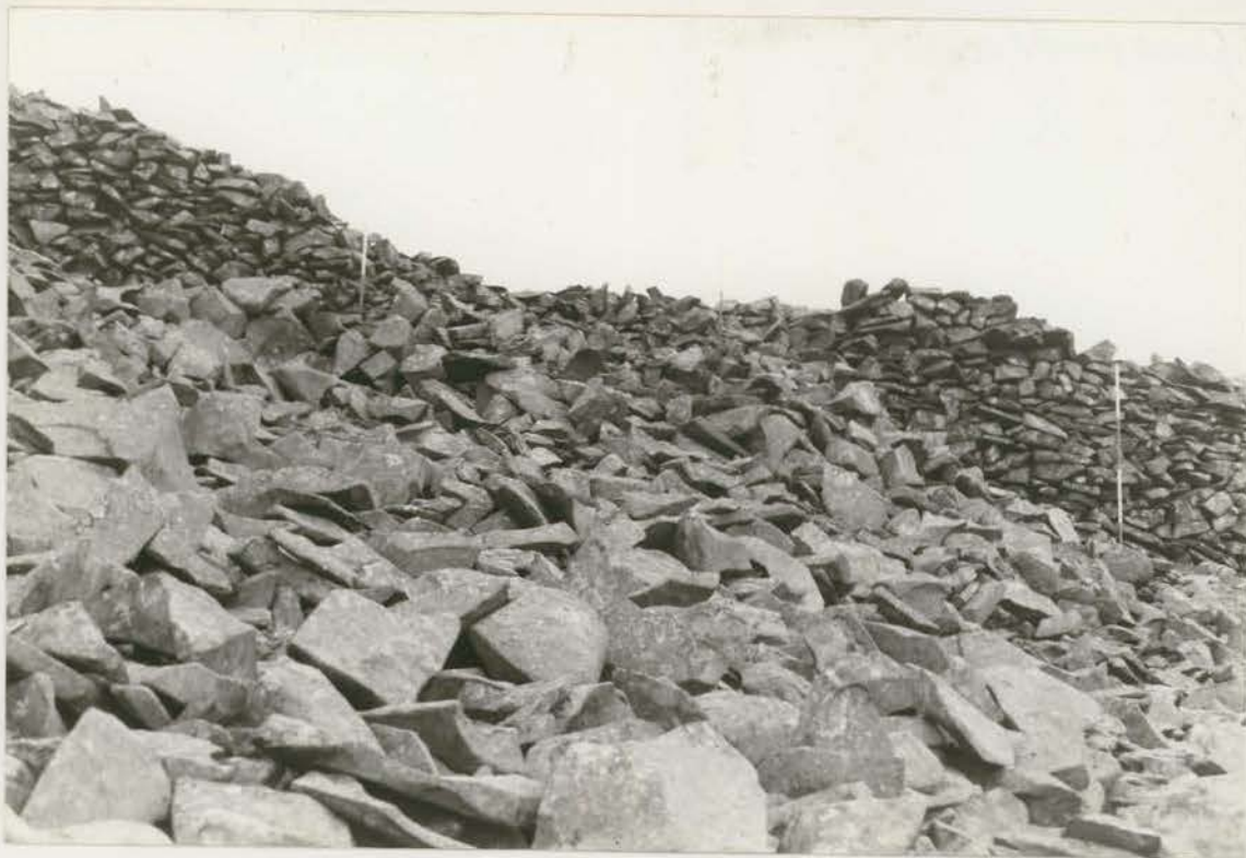
Plate 120. Collapse 'N' before conservation, looking S (G1022/008/06A).