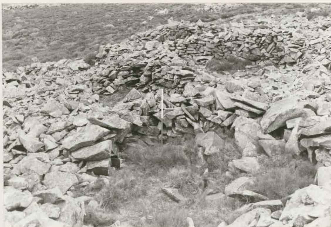
Plate 46. W end of hut 73 before conservation, looking W (G1022/002/14A).