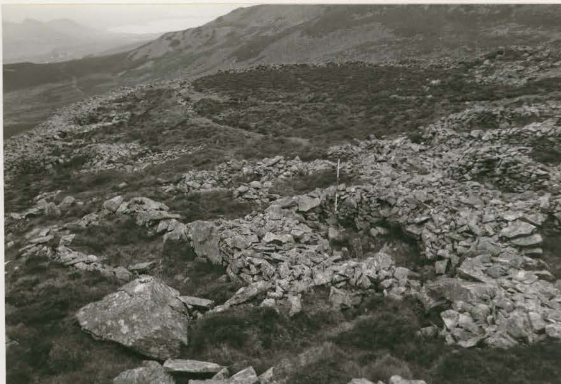
Plate 19. Hut 72 (left of frame) before conservation, looking W (G1022/001/05).