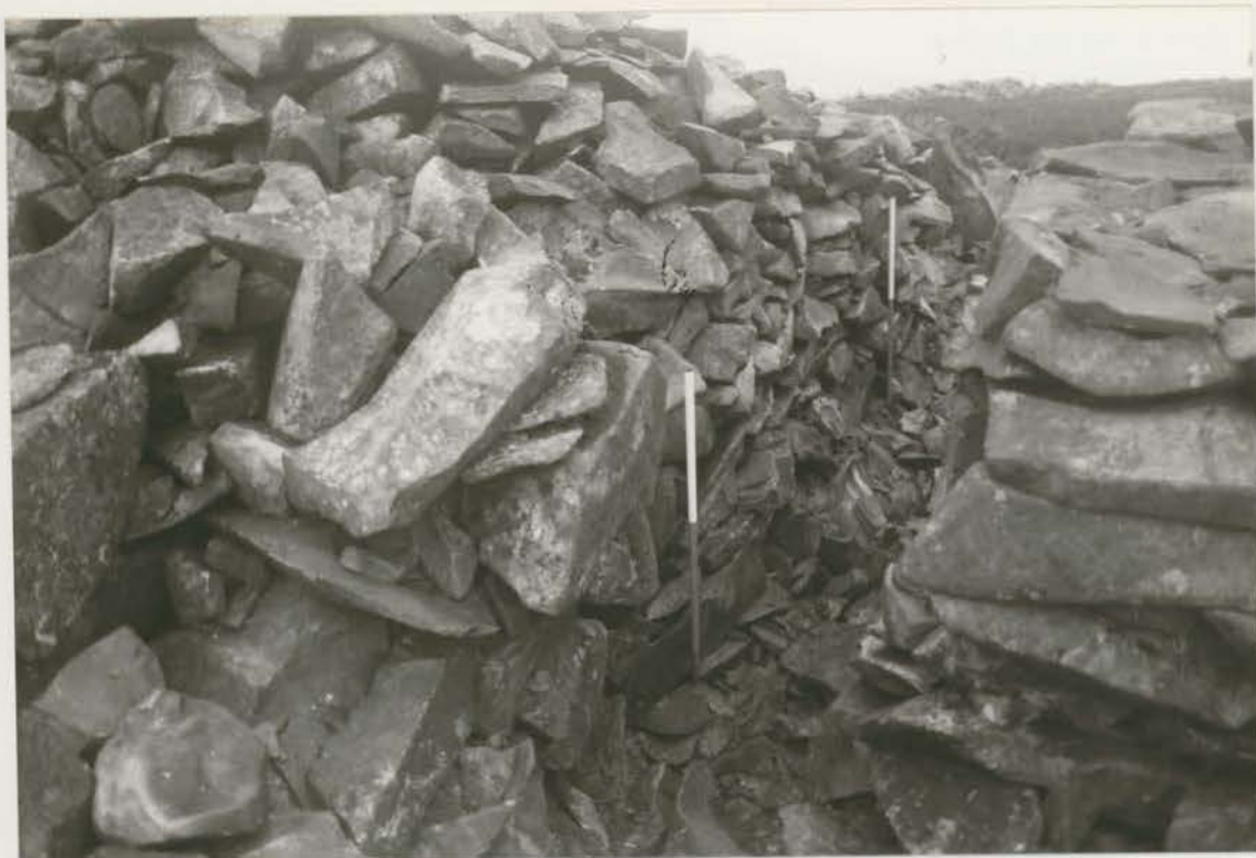
Plate 116. N postern: W side of passage after conservation, looking N (G1022/011/09A).