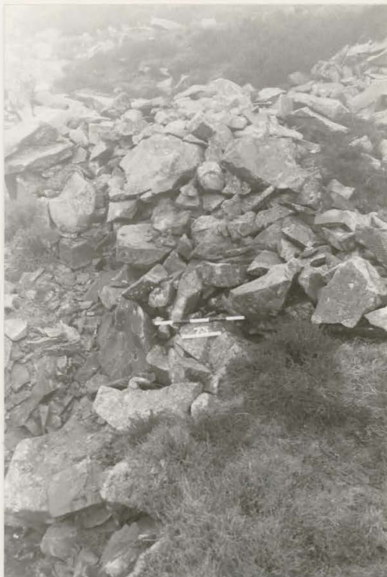
Plate 52. Hut 73: E wall rebuilt, looking E (G1022/022/13A).