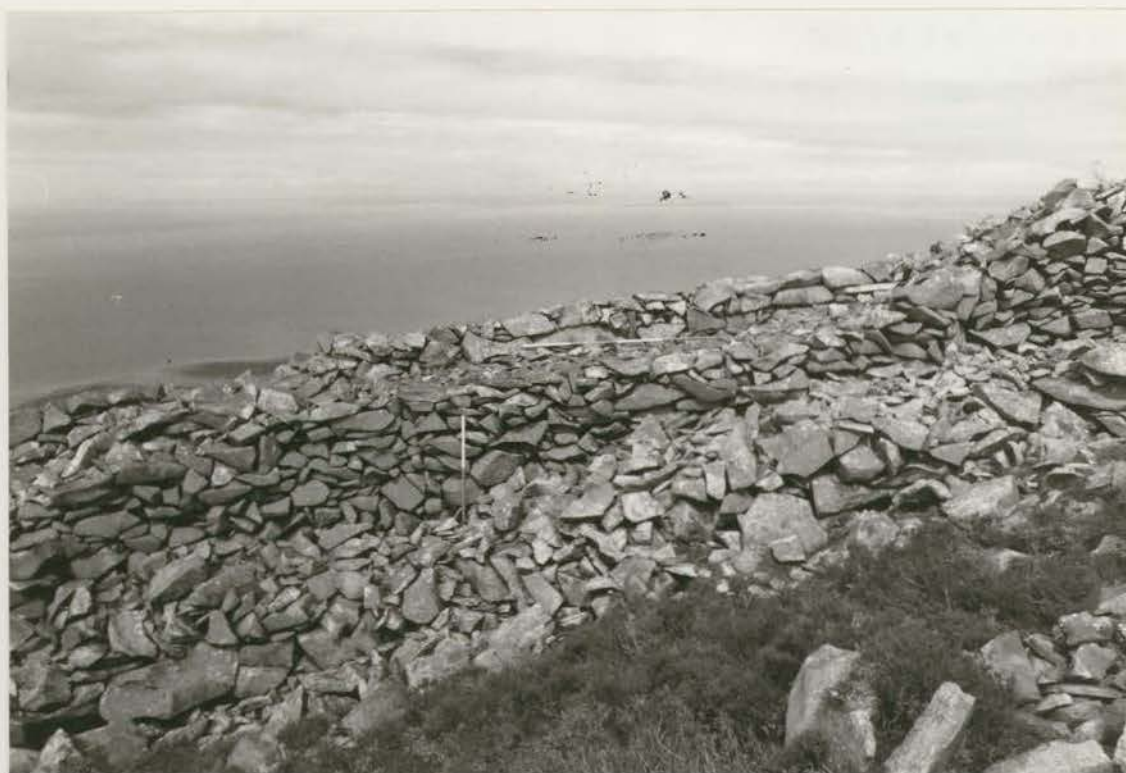
Plate 127. Collapse 'N': inner face after conservation, looking N (G1022/023/35).