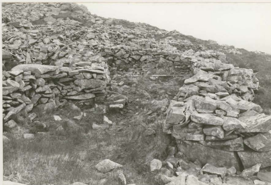
Plate 70. Hut 87 after conservation, looking SE (G1022/022/07A).