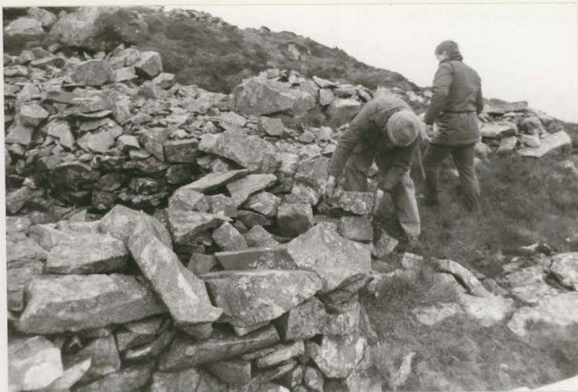
Plate 17. Hut 52: refacing SE corner of hut, looking SE (G1022/005/17A).