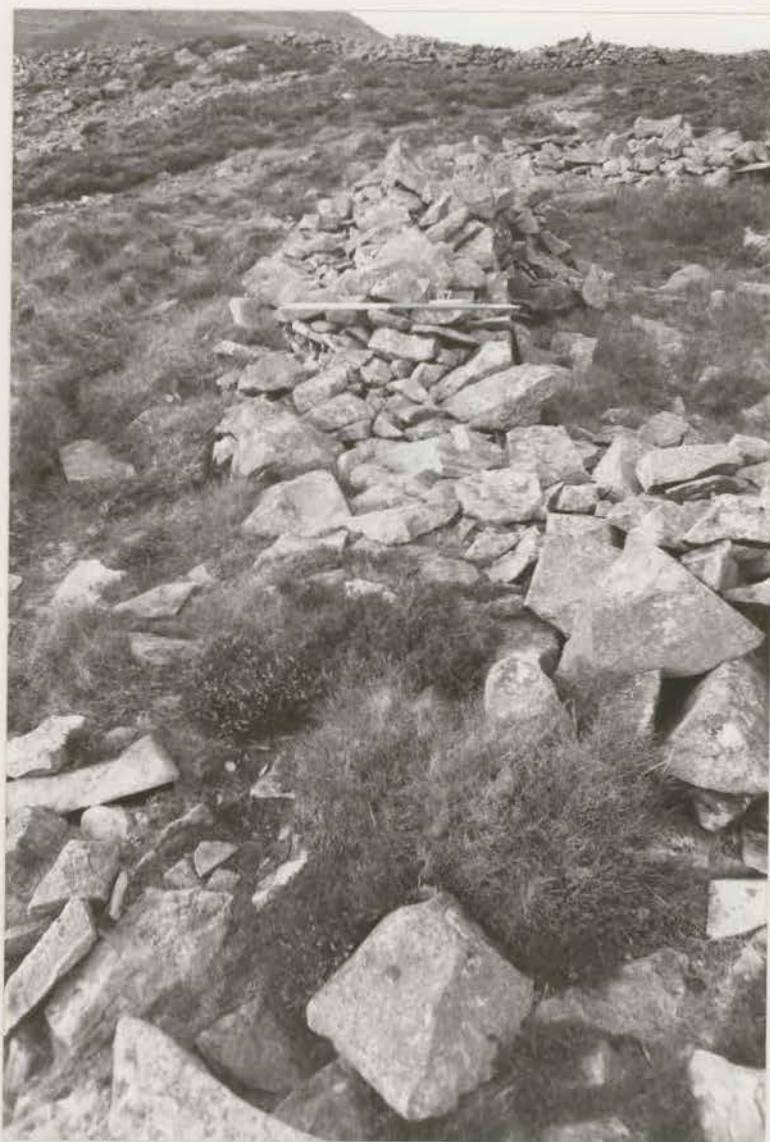
Plate 60. Hut 87: SW wall before conservation, looking NW (G1022/004/20).