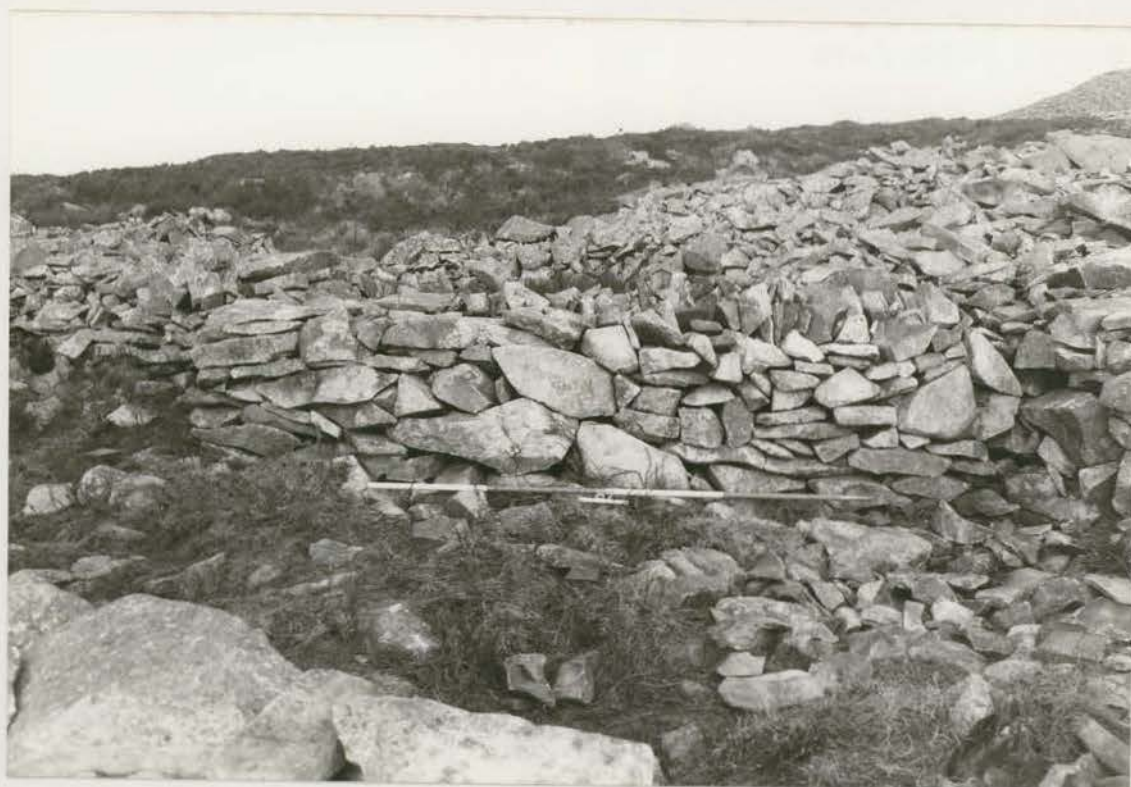
Plate 66. Hut 87: NE wall after conservation, looking NE (G1022/022/09A).