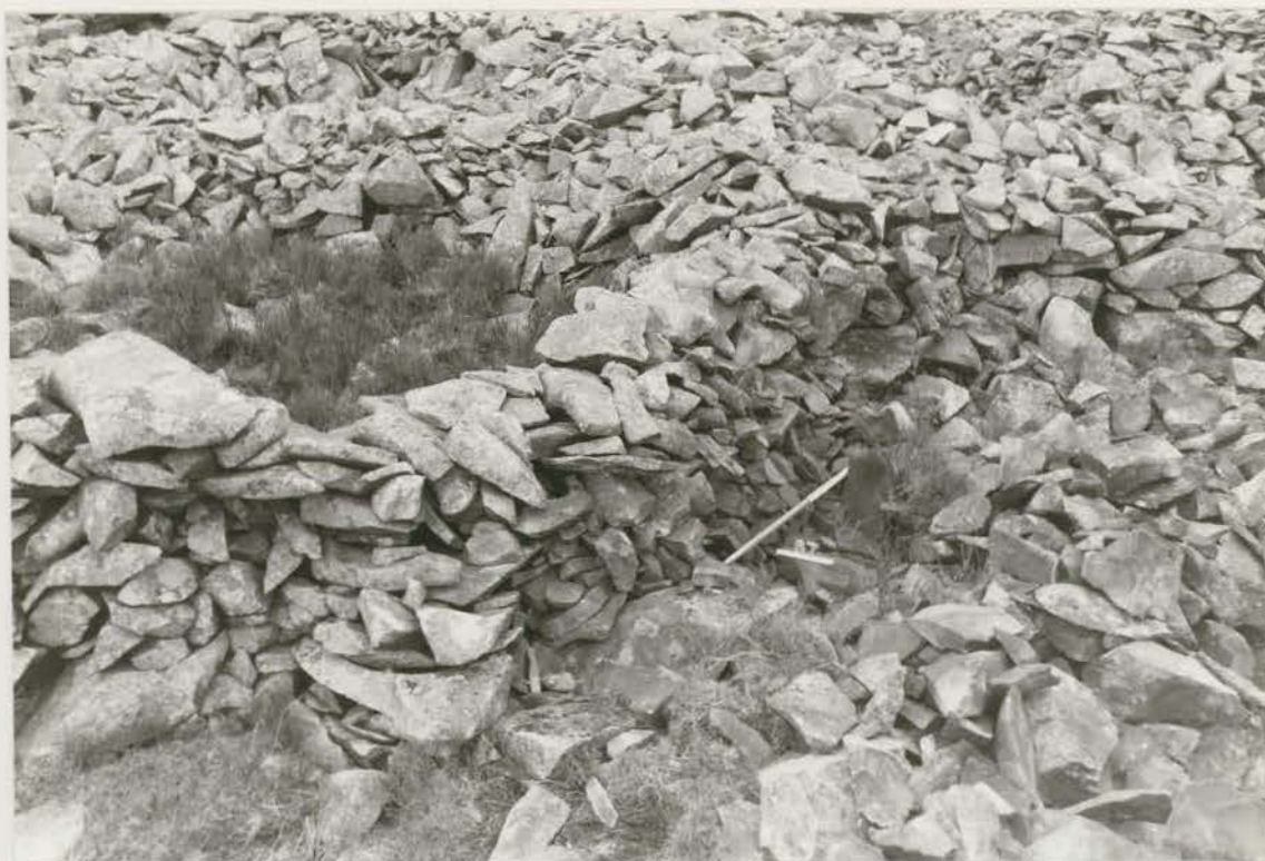
Plate 64. Hut 87: NE wall after removal of tumble, looking E (G1022/007/04).