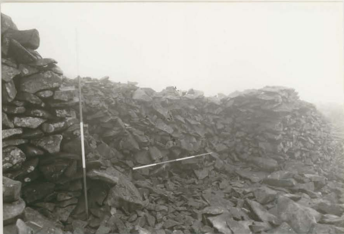
Plate 122. Collapse 'N' after clearance of tumble, looking SW (G1022/012/06).