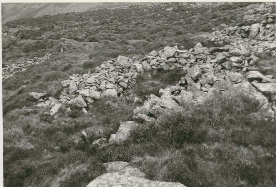
Plate 13. Hut 51 before conservation, looking W (G1022/001/16).