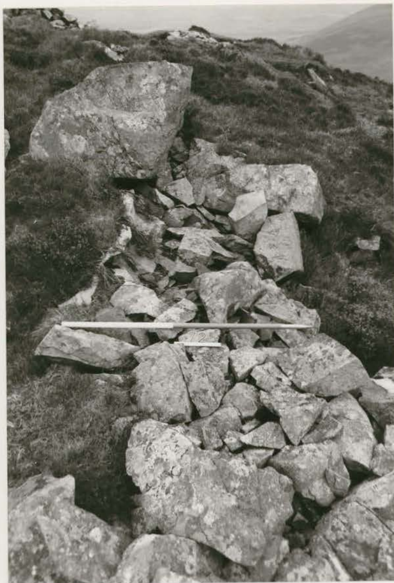
Plate 21. Hut 72: NE wall before conservation, looking SE (G1022/001/31).