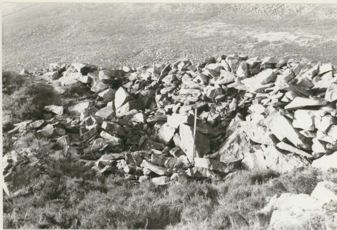
Plate 130. Collapse 'E1' after removal of tumble, looking W (G1022/014/18).