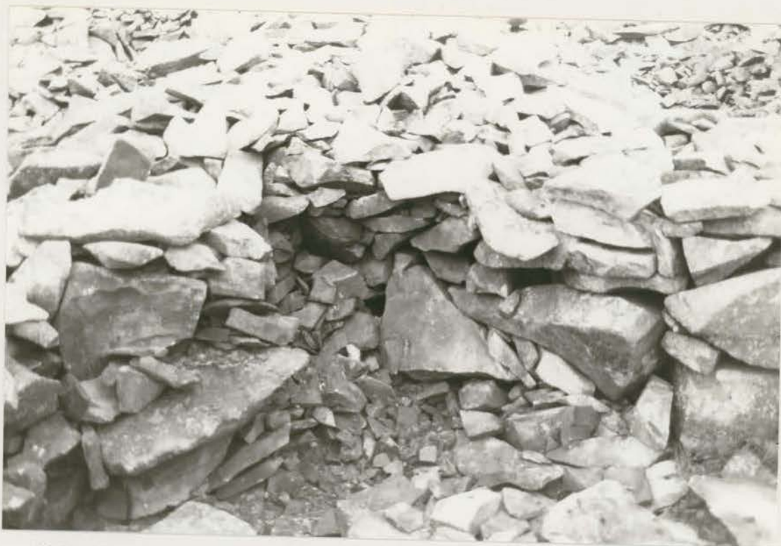
Plate 65. Hut 87: core removed at E corner, exposing outer face of hut 53, looking E (G1022/015/24).