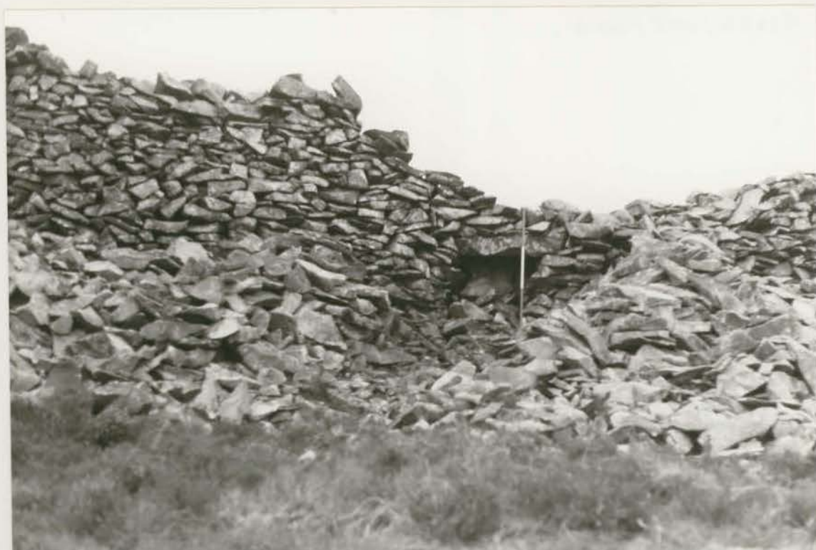
Plate 100. N postern: access cleared in front of passage, looking S (G1022/008/24A).