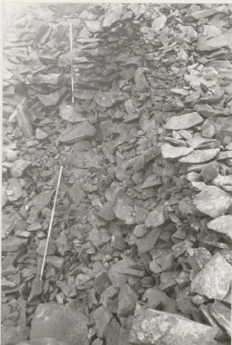
Plate 121. Collapse 'N' after clearance of tumble, looking E (G1022/012/09).