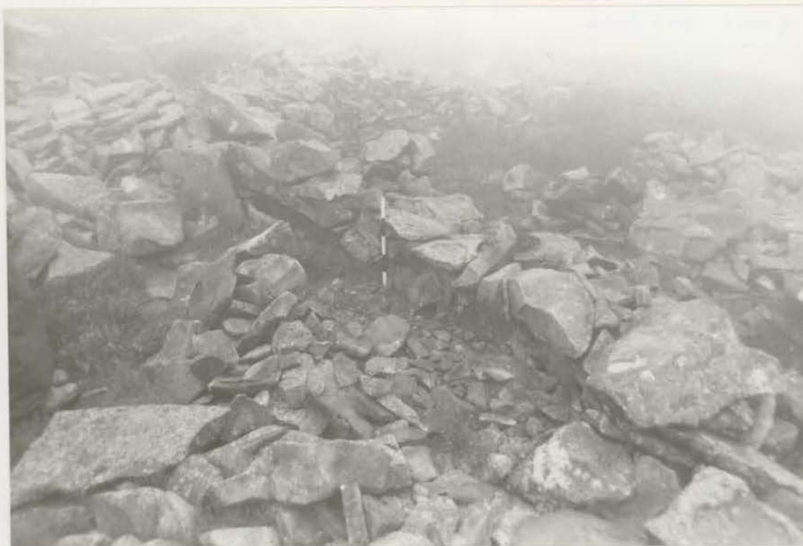
Plate 7. Hut 86: outer face of NE wall after clearance of tumble, looking S (G1022/005/15A).