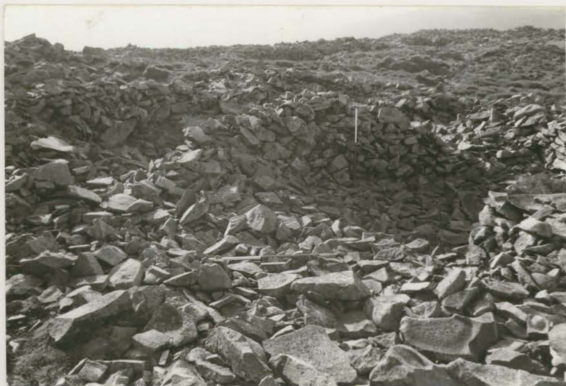
Plate 76. Huts 89 & 90: internal partition before conservation, looking SE (G1022/004/02).