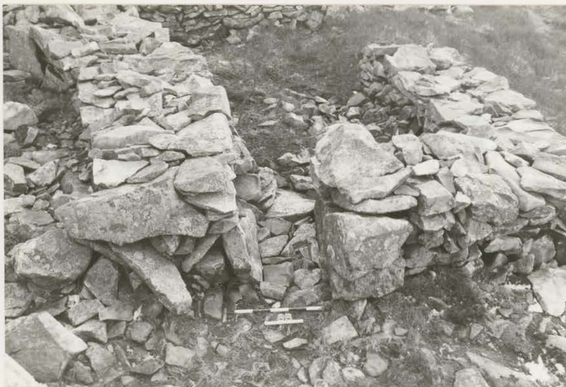
Plate 5. Hut 86: NE wall and entrance restored, looking SE (G1022/022/04A).