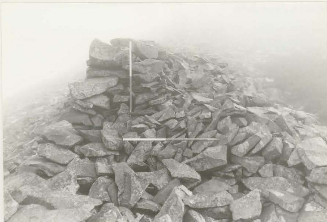
Plate 101. Parapet to E of N postern, looking E (G1022/009/09A).