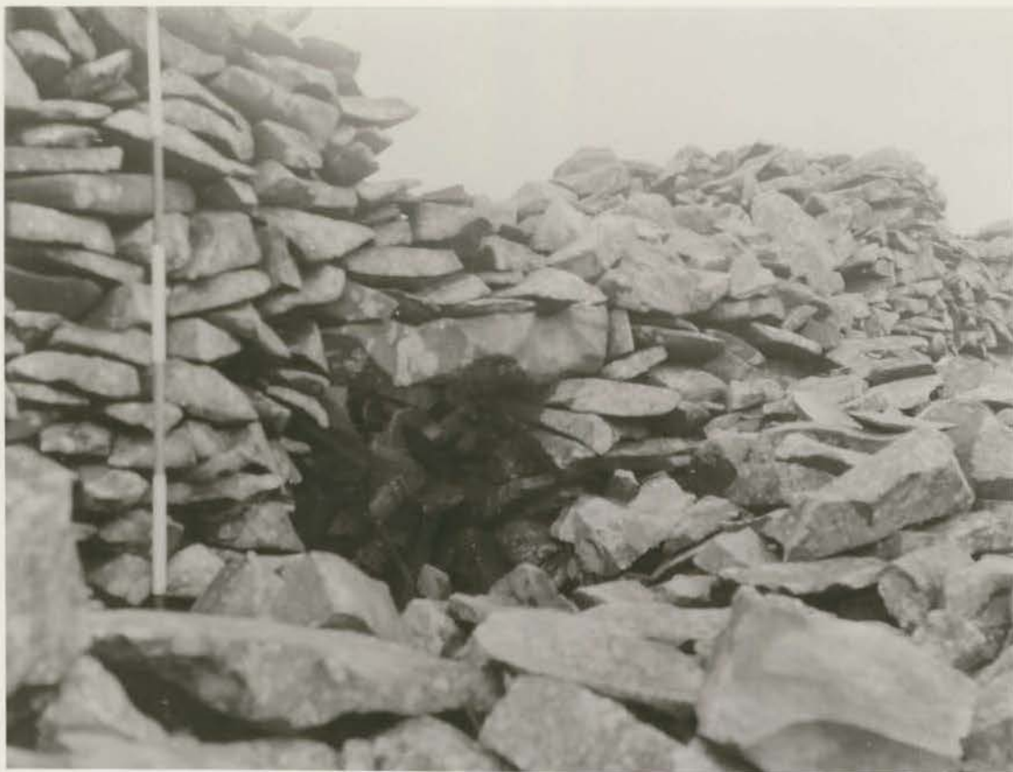
Plate 95. N postern, outer end in 1956, looking SW.