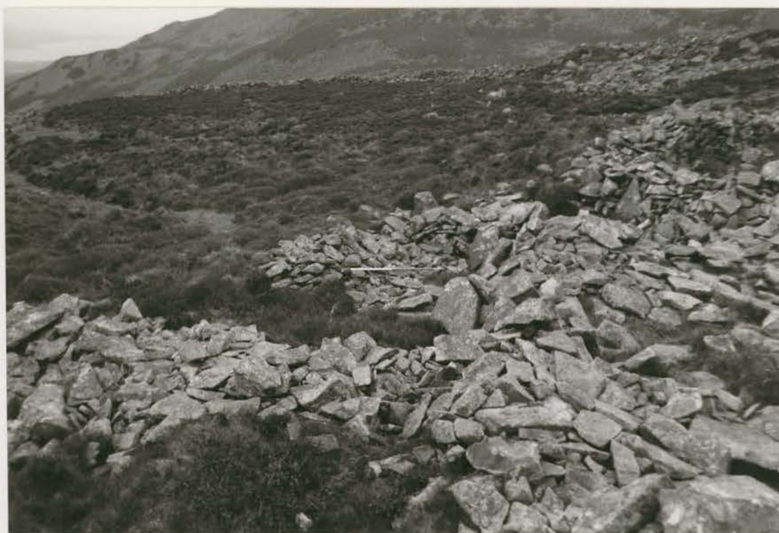
Plate 9. Hut 86 before conservation, looking W (G1022/001/11).