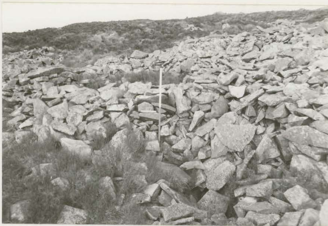
Plate 59. Hut 87: NE wall before conservation, looking NE (G1022/004/25).