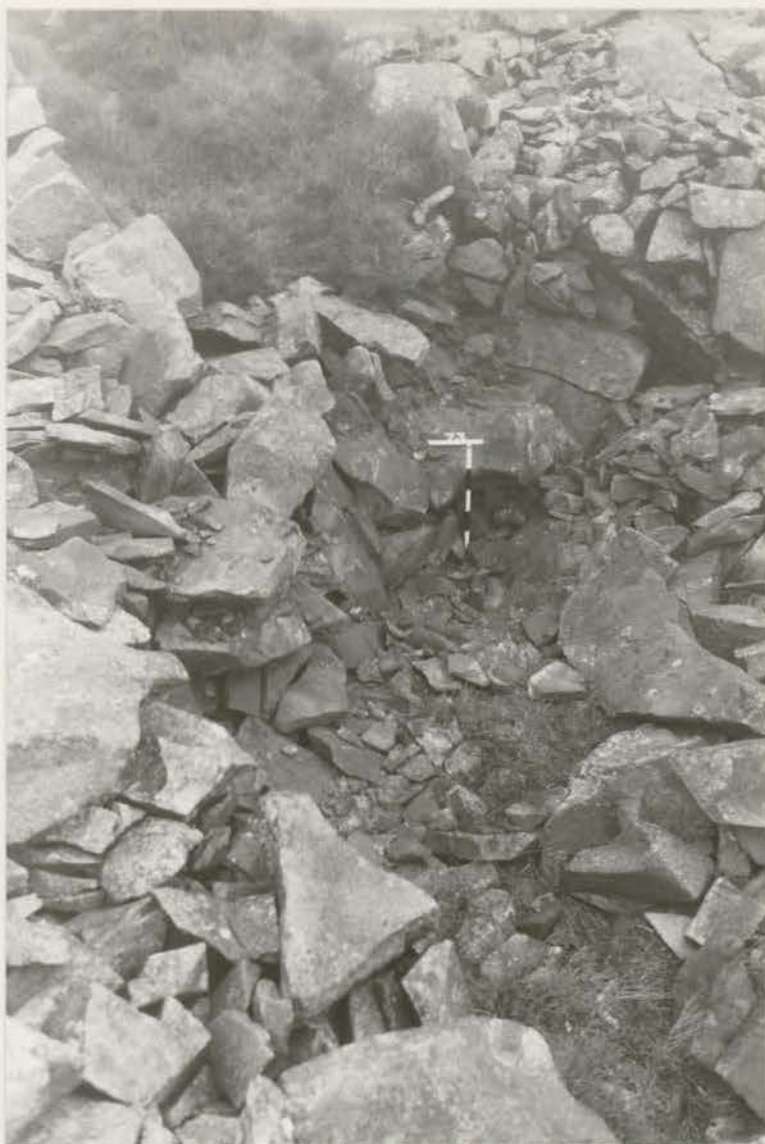
Plate 50. Hut 73: E wall, tumble removed, with W corner of hut 74 exposed, looking E (G1022/006/03).