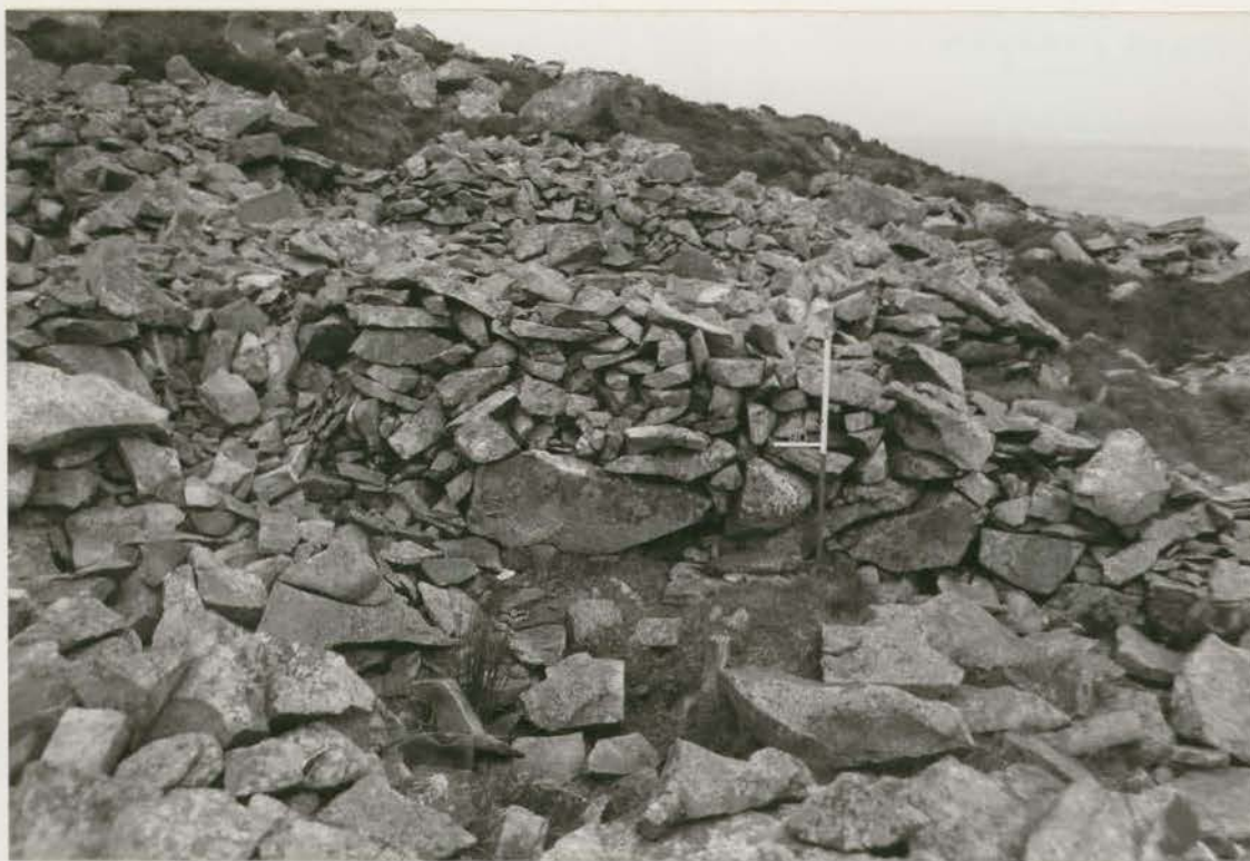
Plate 73. Hut 90: SE wall before conservation, looking SE (G1022/003/04).