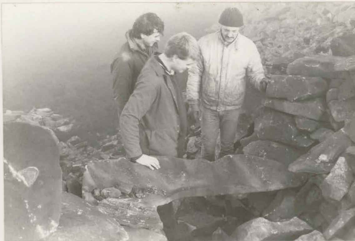
Plate 105. N postern: the outer lintel before removal (G1022/010/04).