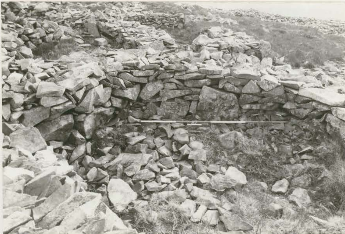
Plate 68. Hut 87: E and S walls after conservation, looking S (G1022/022/10A).