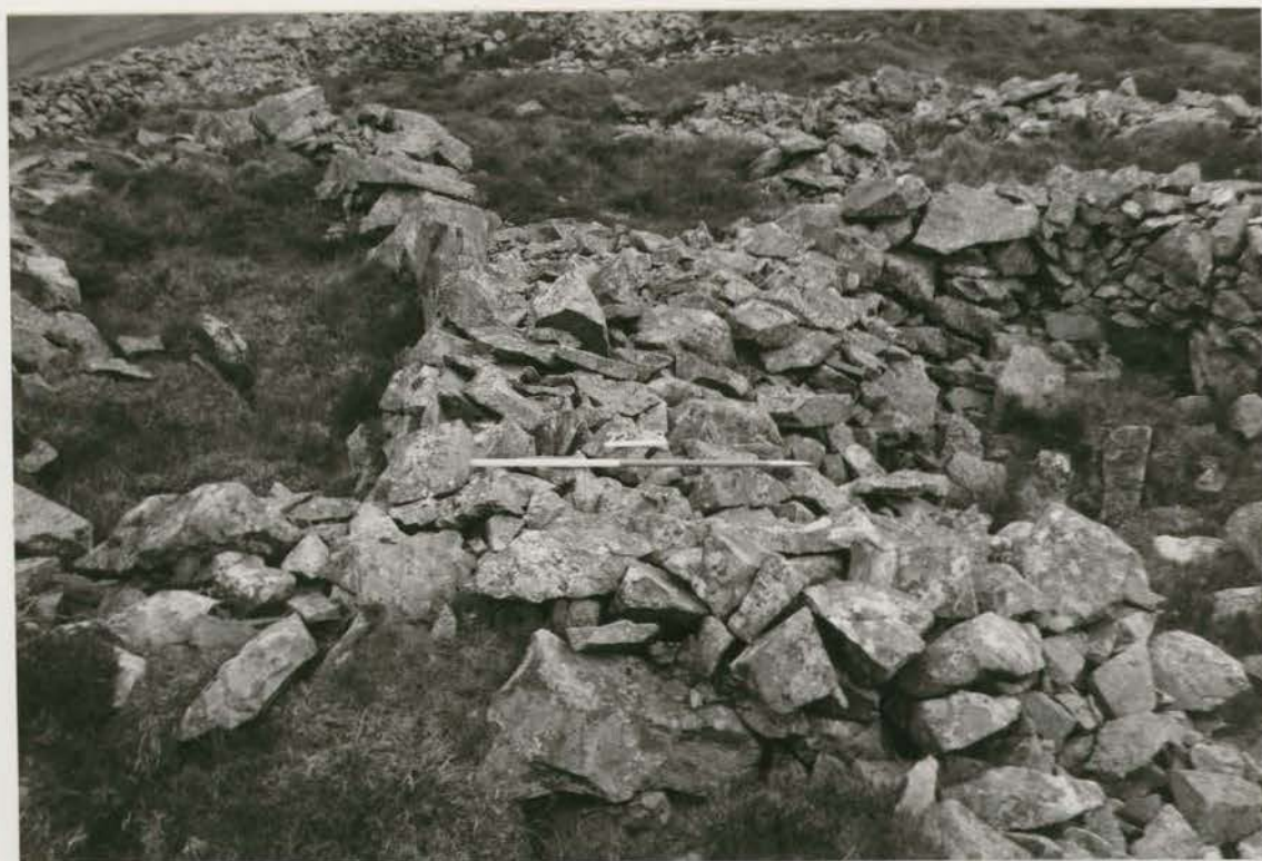
Plate 32. Wall between huts 72 and 92 before conservation looking SW (G1022/001/32).