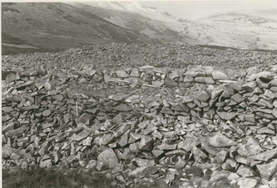
Plate 128. Collapse 'N': inner face after conservation, looking NW (G1022/023/36).