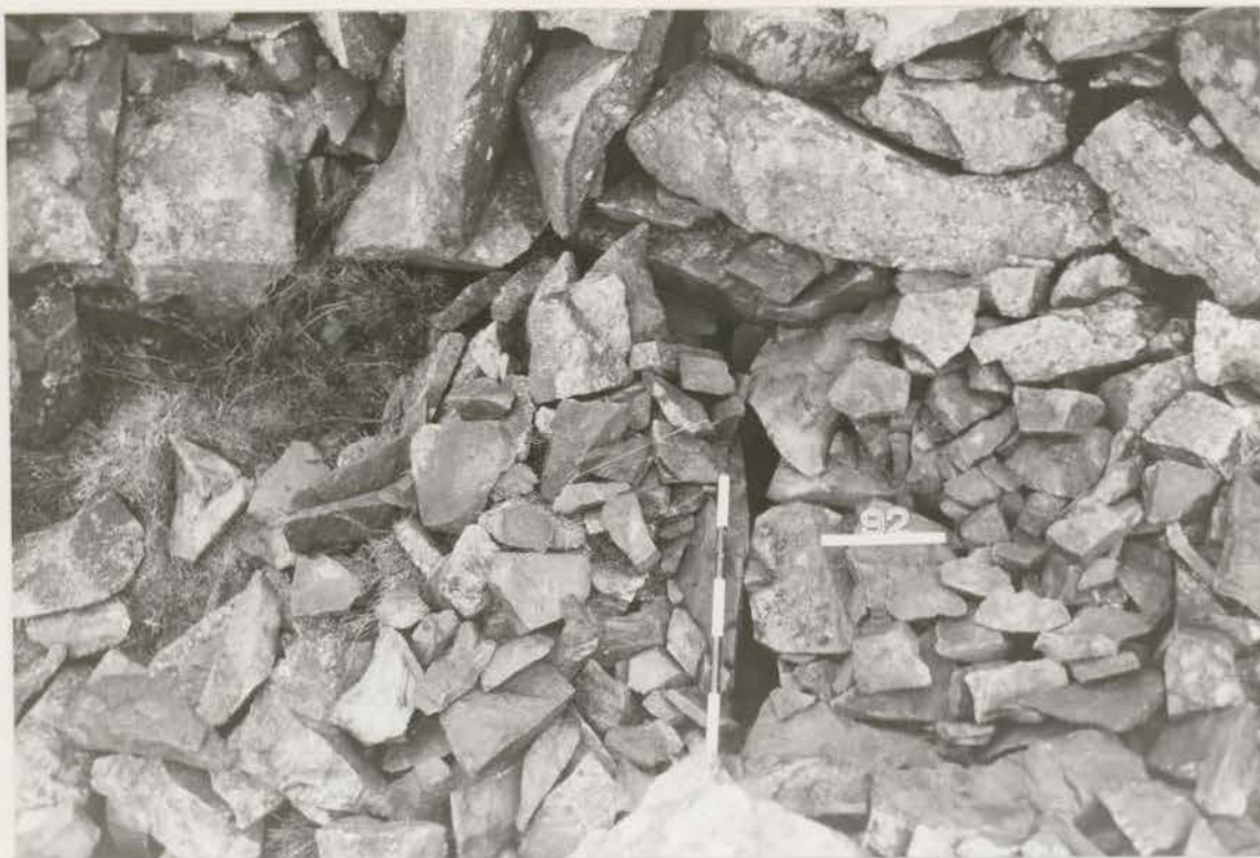
Plate 39. Hut 92: inner end of E entrance, after removal of rubble, looking NE (G1022/005/22A).