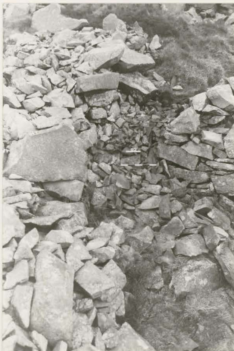
Plate 38. Hut 92: rubble removed from E entrance, looking E (G1022/005/24A).