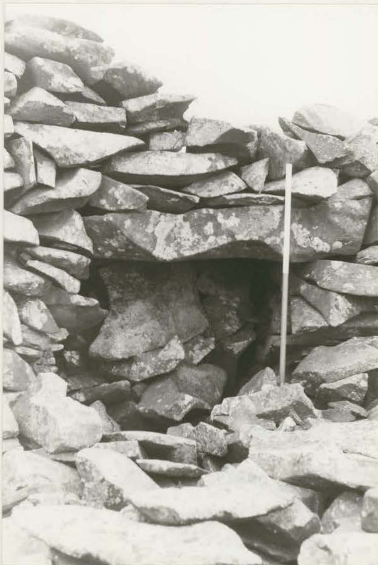
Plate 96. N postern, outer end before conservation in 1989, looking S (G1022/008/08A).