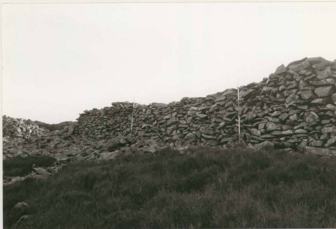
Plate 135. Collapse 'F1' after conservation, looking E (G1022/023/14).