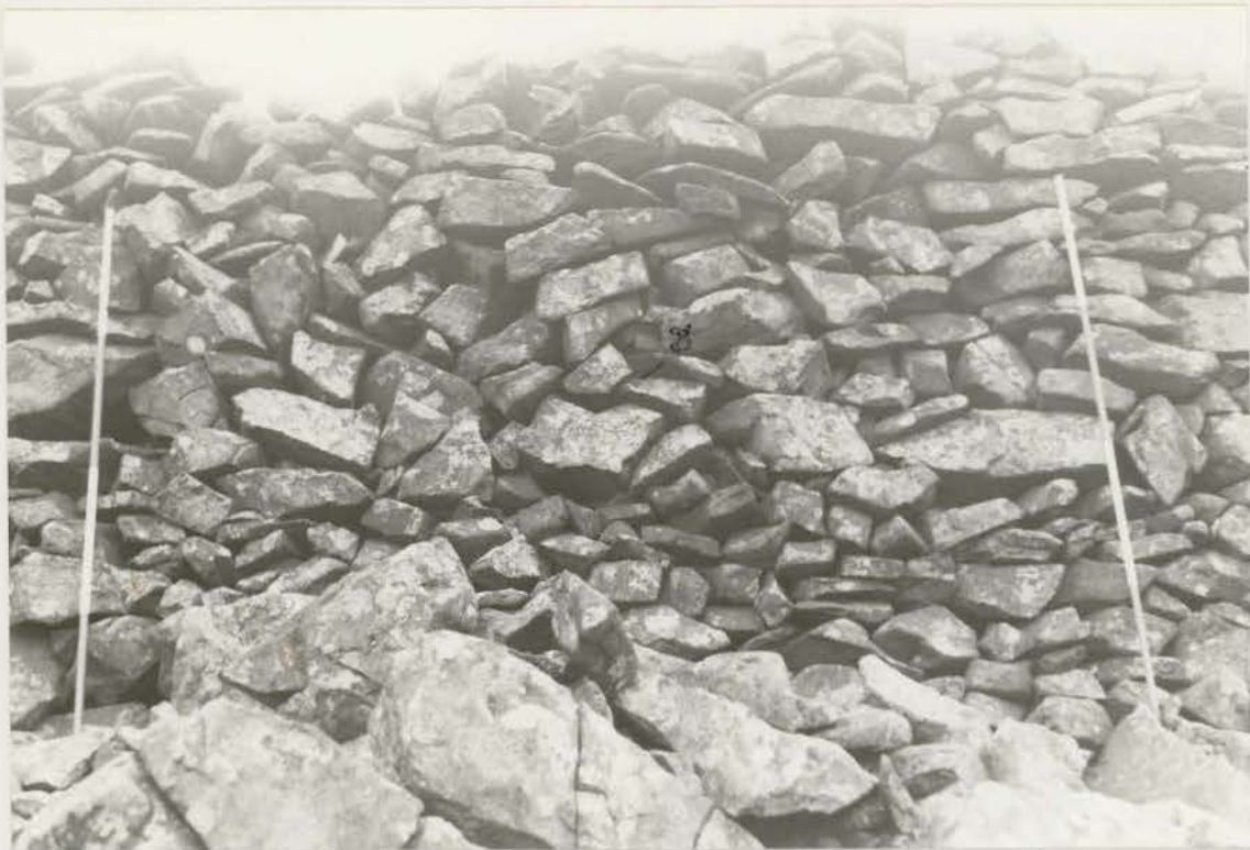
Plate 93. Inner rampart, length D - E, showing changes in construction (G1022/016/23A).