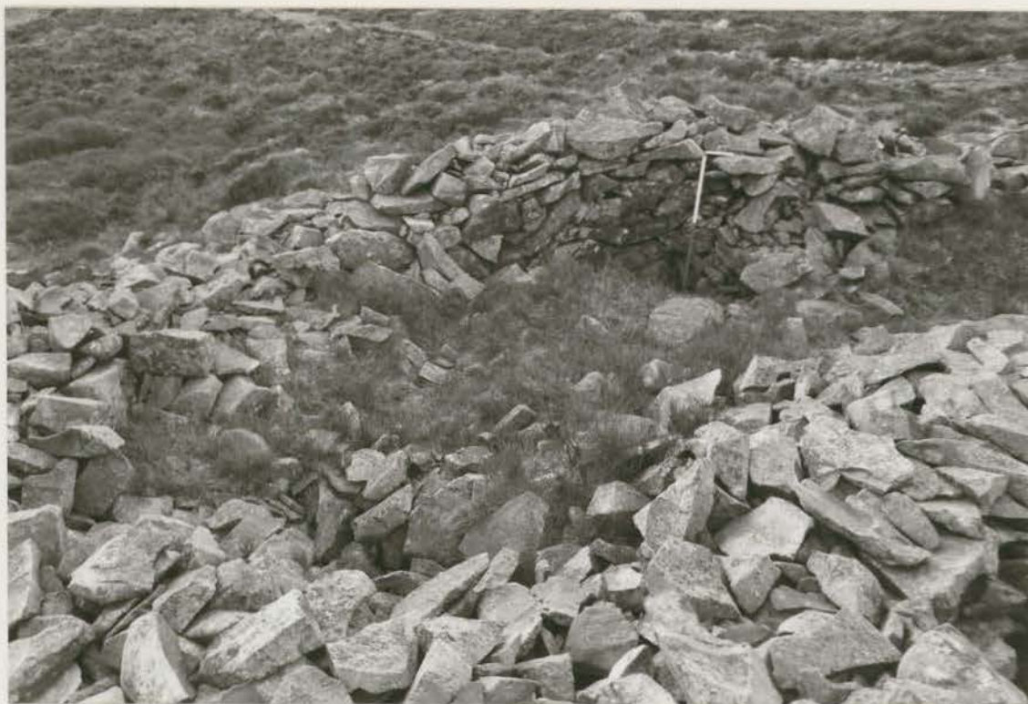
Plate 61. Hut 87: interior and W corner before conservation, looking W (G1022/004/18).