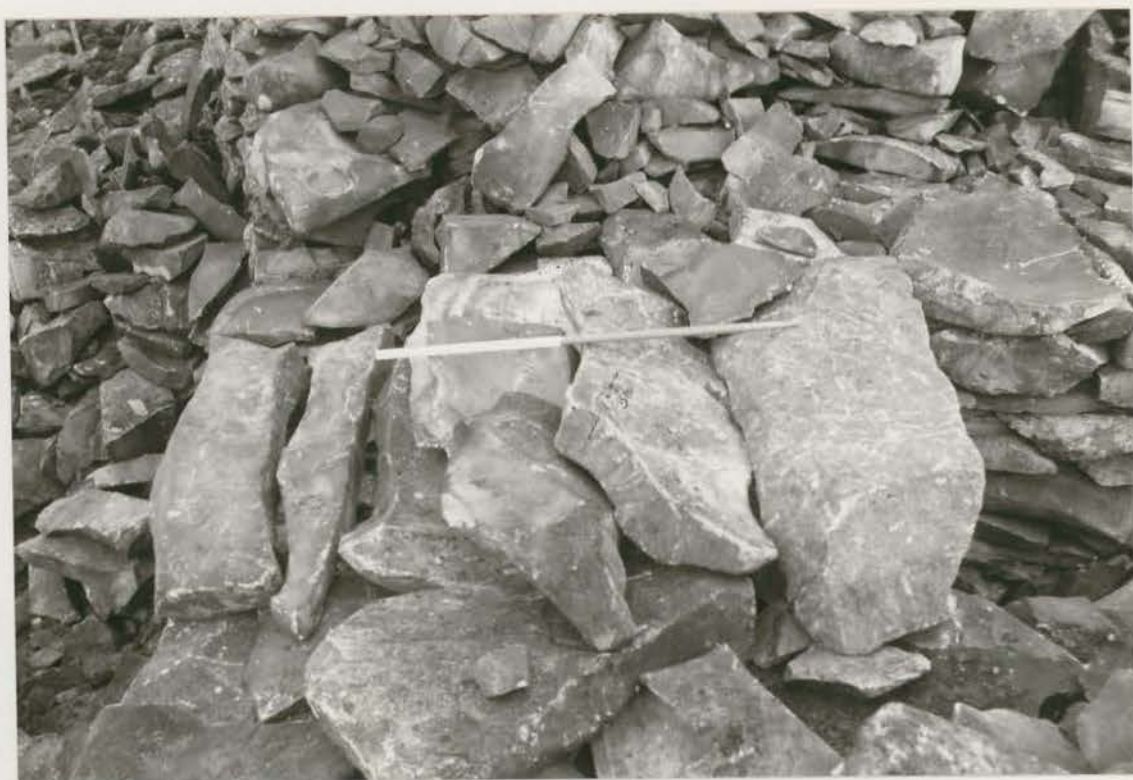
Plate 117. N postern, with replacement lintels, looking E (G1022/011/18A).