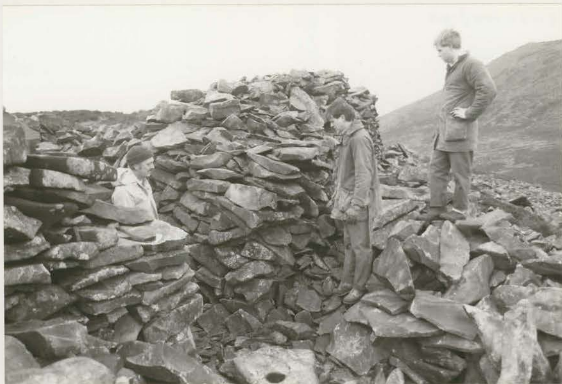
Plate 110. N postern: outer W corner before conservation, looking W (G1022/011/15A).