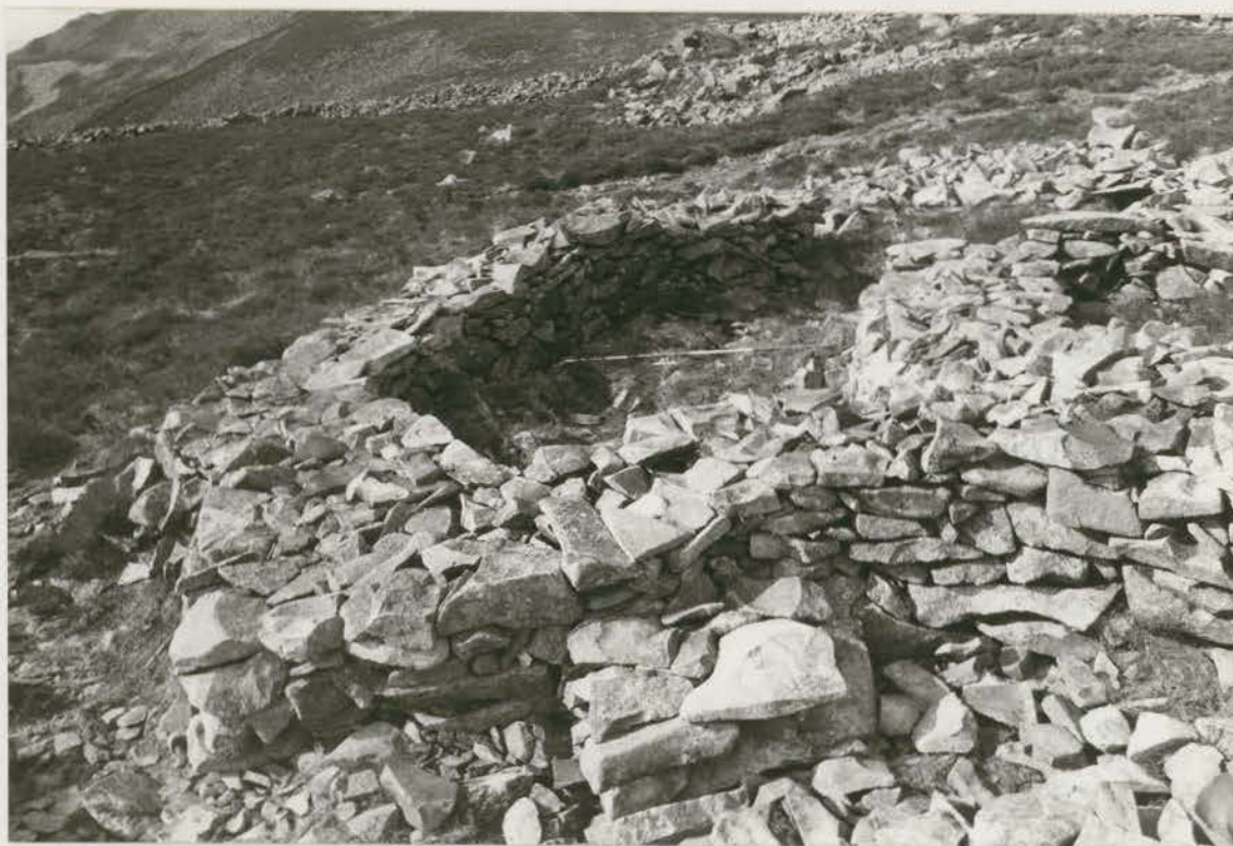
Plate 69. Hut 87 and W wall of hut 53 after conservation, looking W (G1022/022/11A).