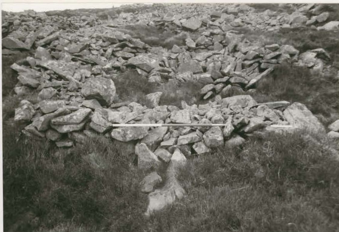
Plate 11. Hut 51 before conservation, looking NE (G1022/001/19).