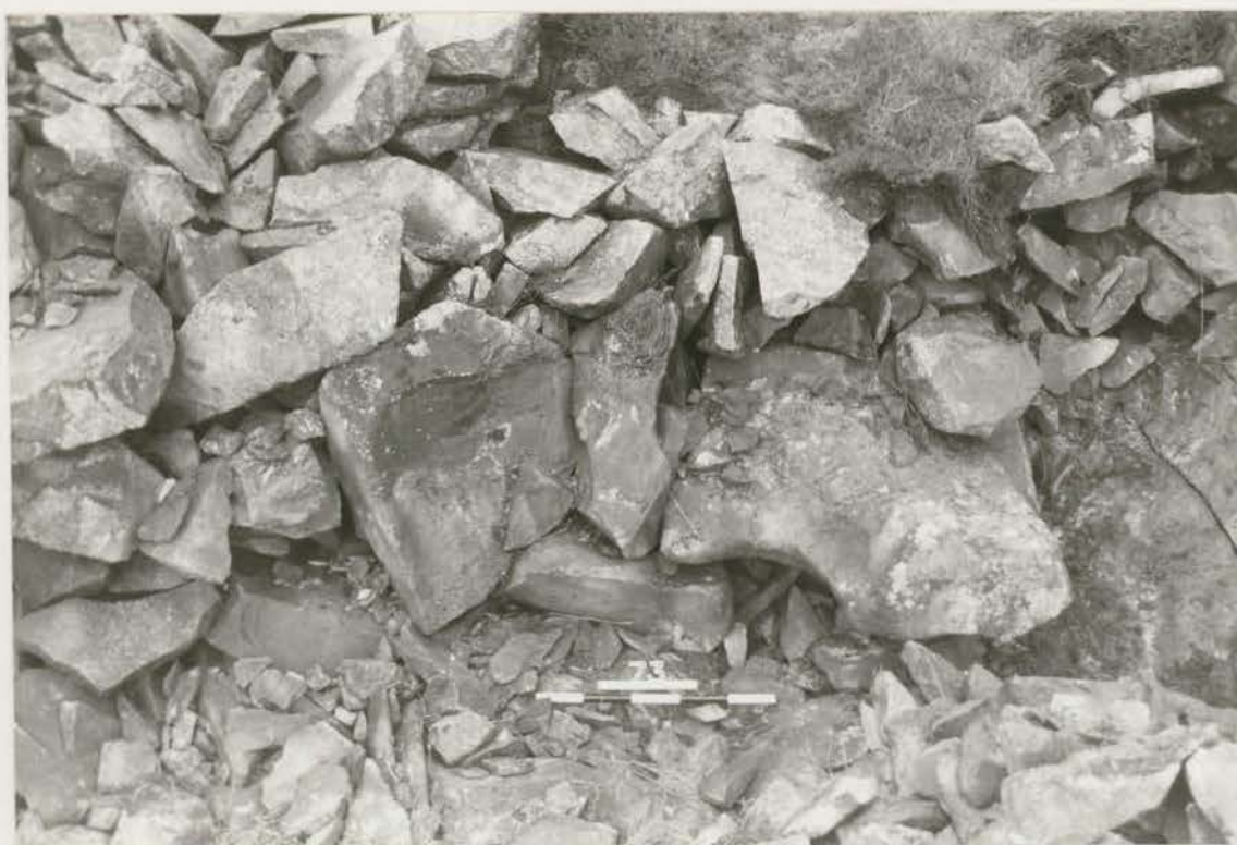
Plate 48. Hut 73: E wall, tumble removed, looking E (G1022/006/02).