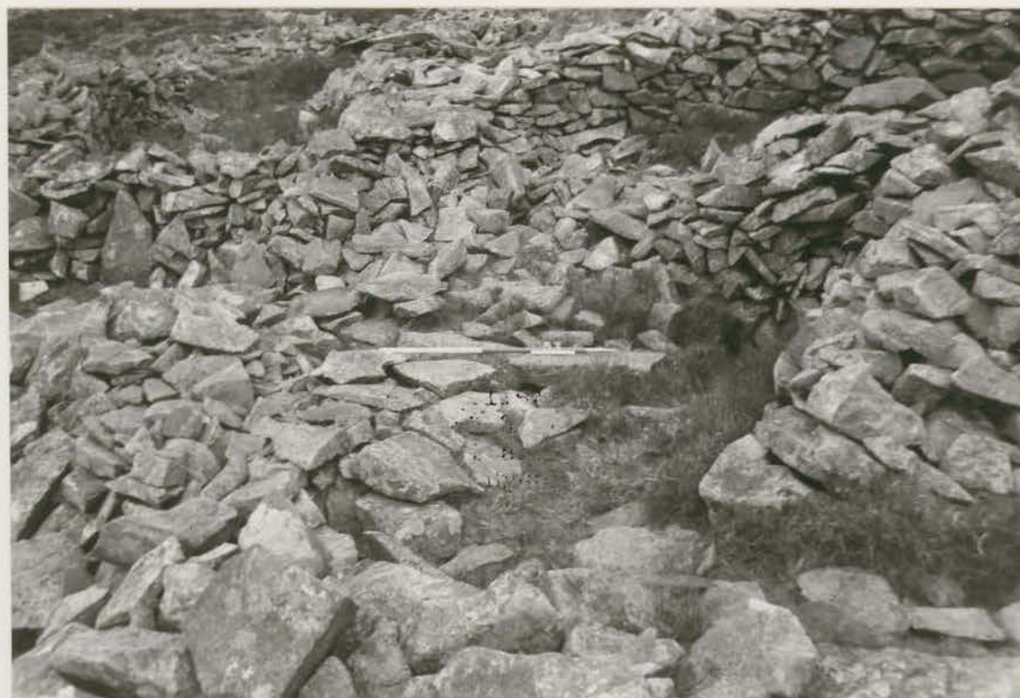
Plate 72. Hut 53: interior and W wall before conservation, looking NW (G1022/003/12).