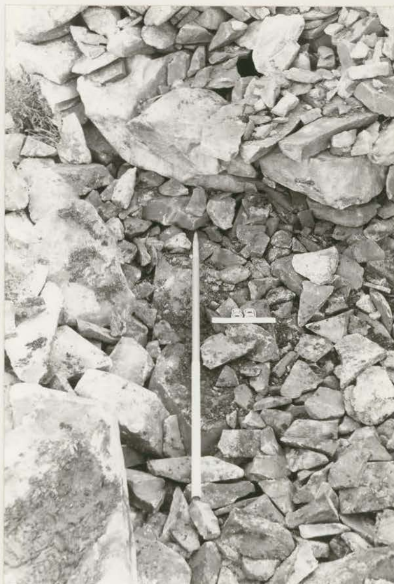
Plate 86. Hut 89: restored N and NE walls, looking NE (G1022/022/31A).