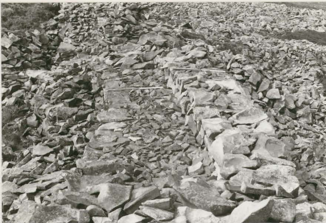
Plate 126. Collapse 'N': top of wall after conservation, with rebuilt parapet, looking W (G1022/023/34).