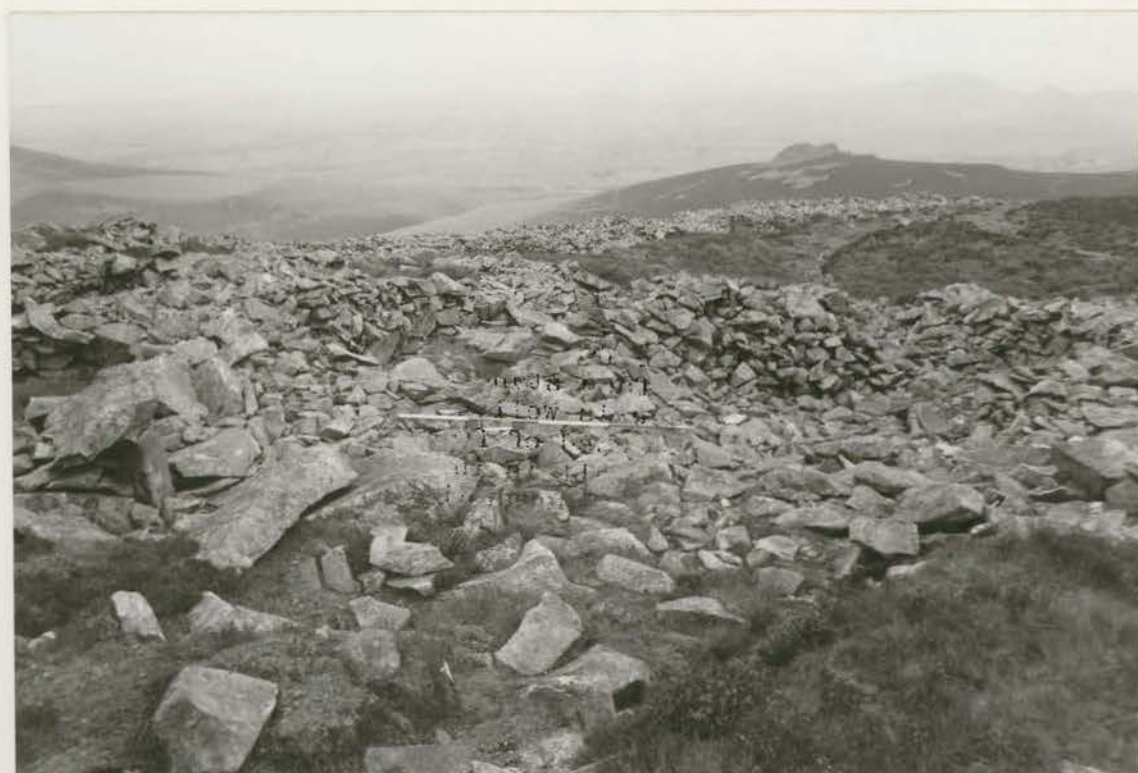
Plate 74. Huts 89 & 90: E and NE walls before conservation, looking SW (G1022/003/01).