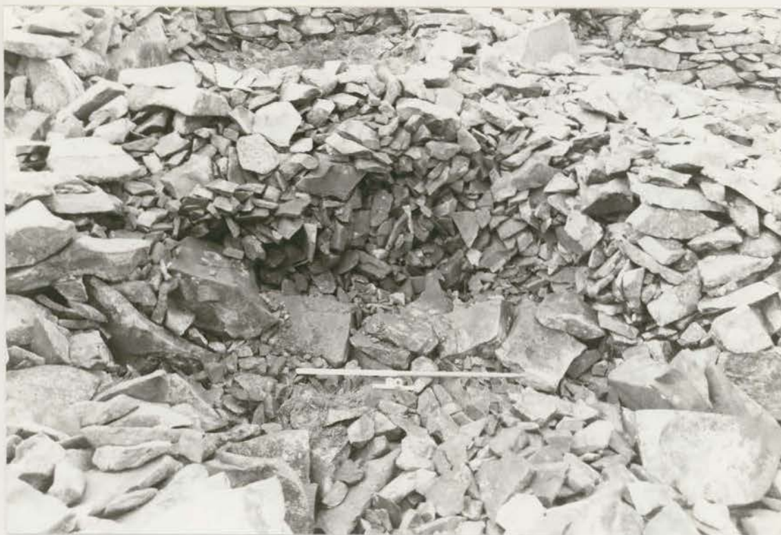
Plate 83. Hut 90: base of E wall after removal of collapse, looking E (G1022/015/33).