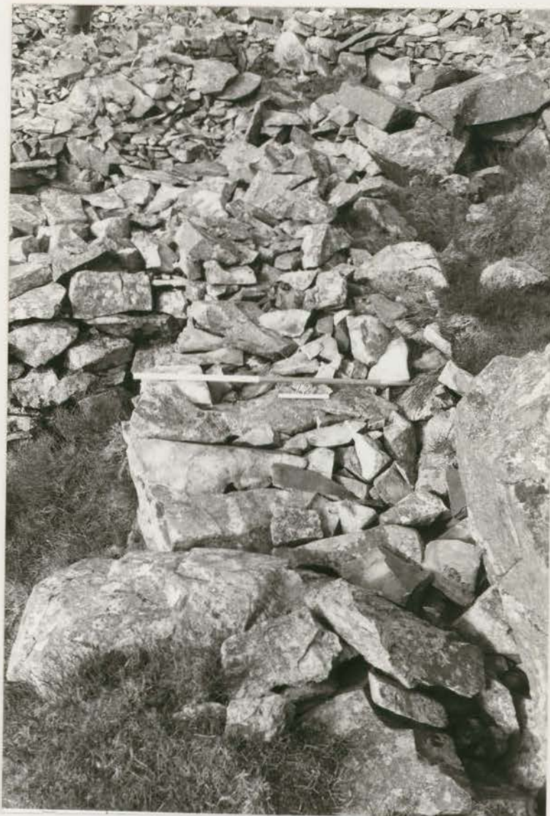
Plate 23. Hut 72: NE wall after conservation, looking NE (G1022/022/19A).