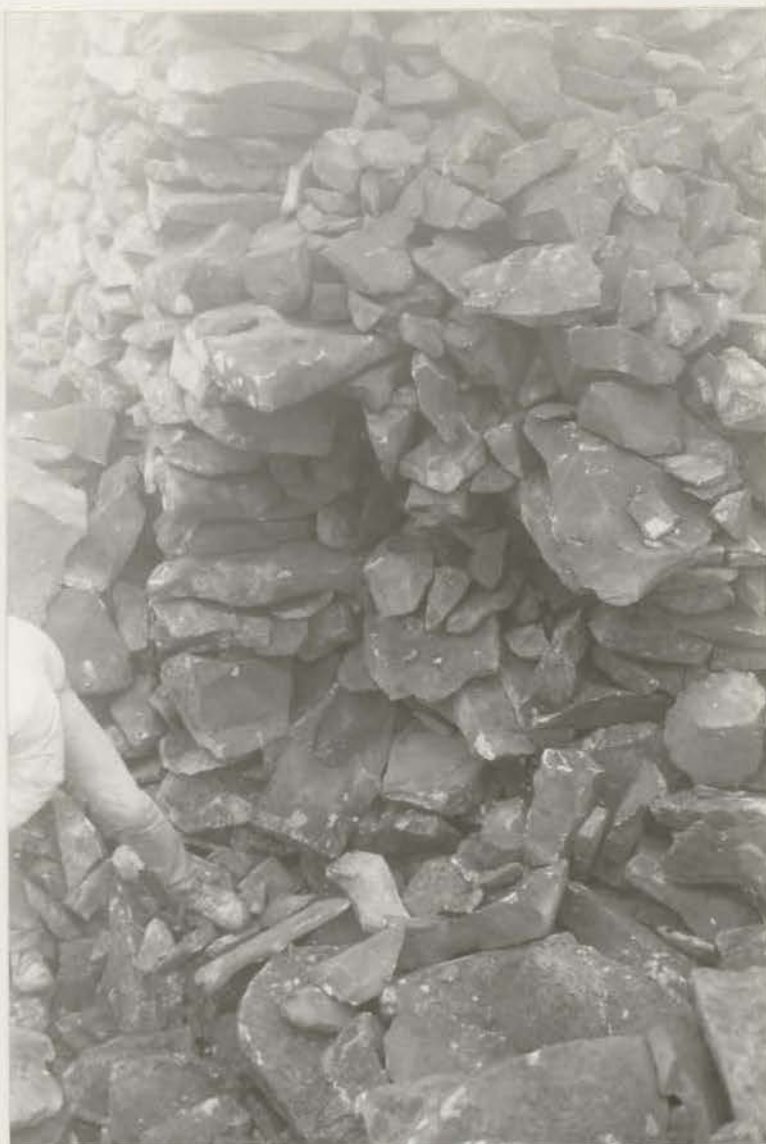
Plate 109. N postern after conservation, looking S (G1022/023/27).