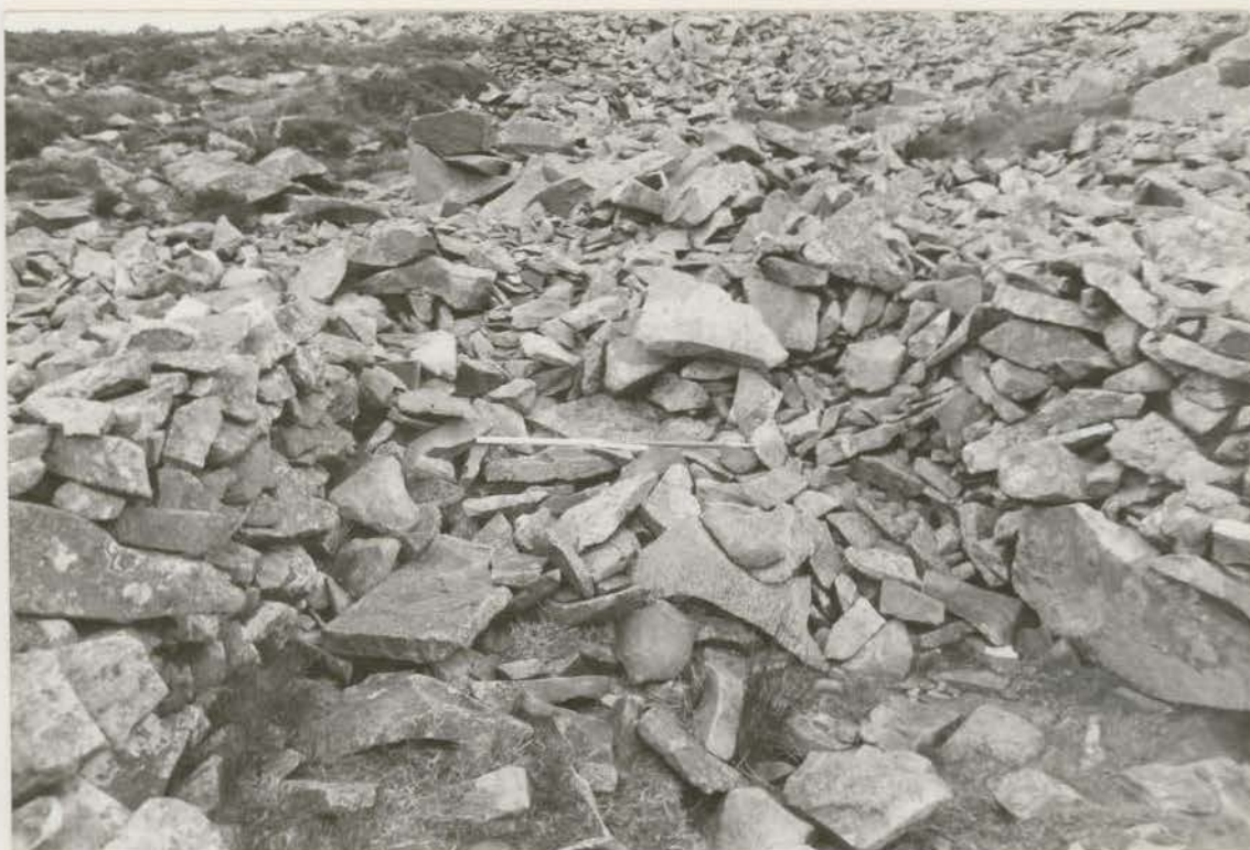
Plate 75. Hut 90: E wall before conservation, looking NE (G1022/003/03).