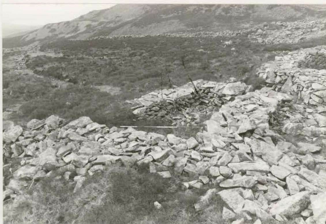
Plate 10. Hut 86 after conservation, looking W (G1022/022/06A).