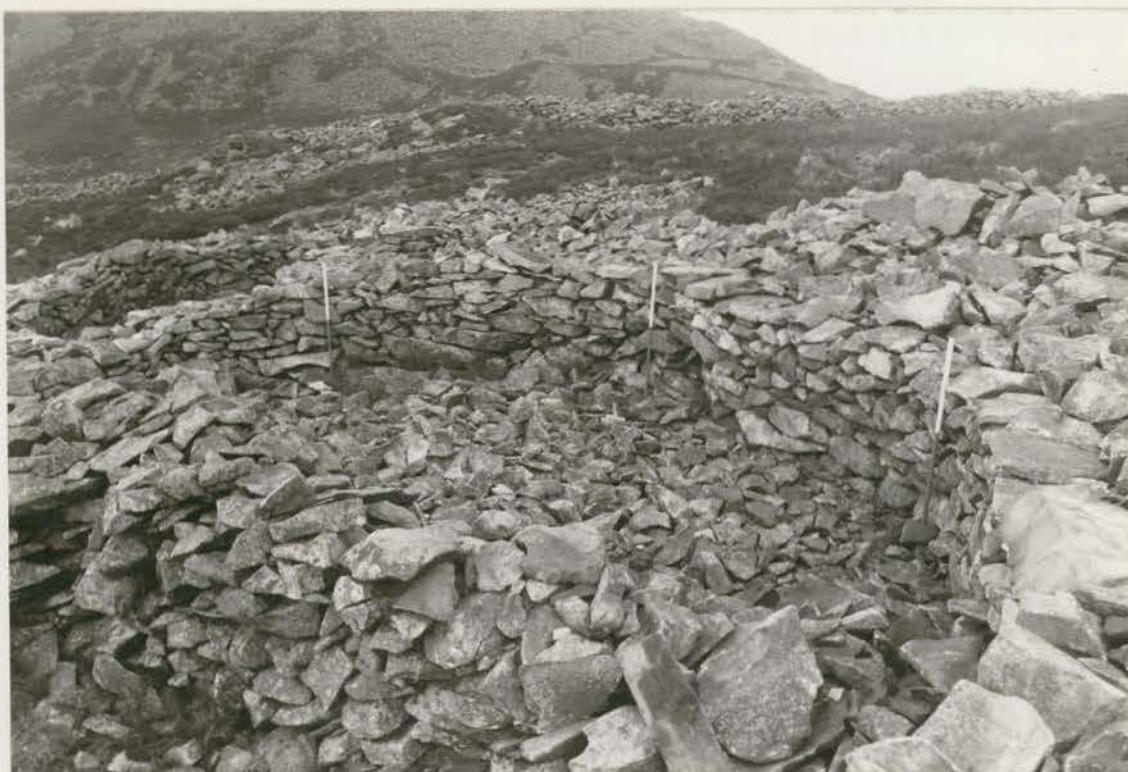
Plate 91. Hut 89: general view after conservation, looking W (G1022/022/32A).