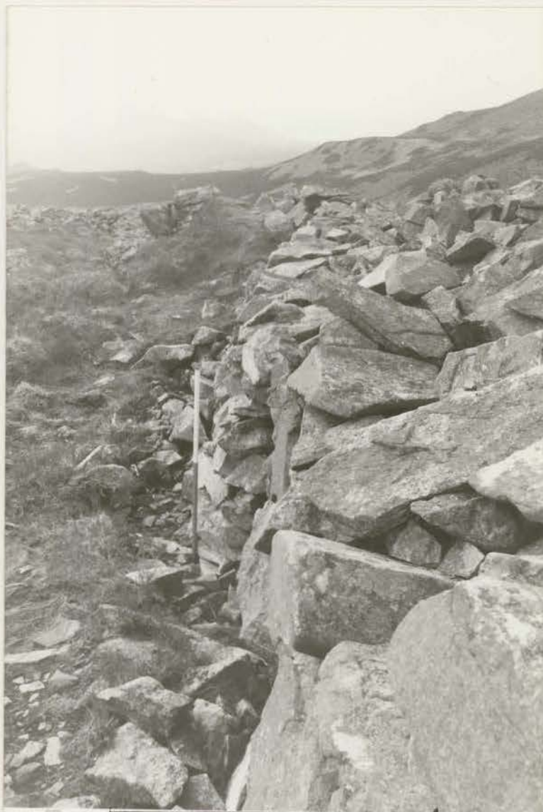
Plate 133. Collapse 'E1' after conservation, looking NW (G1022/022/22A).