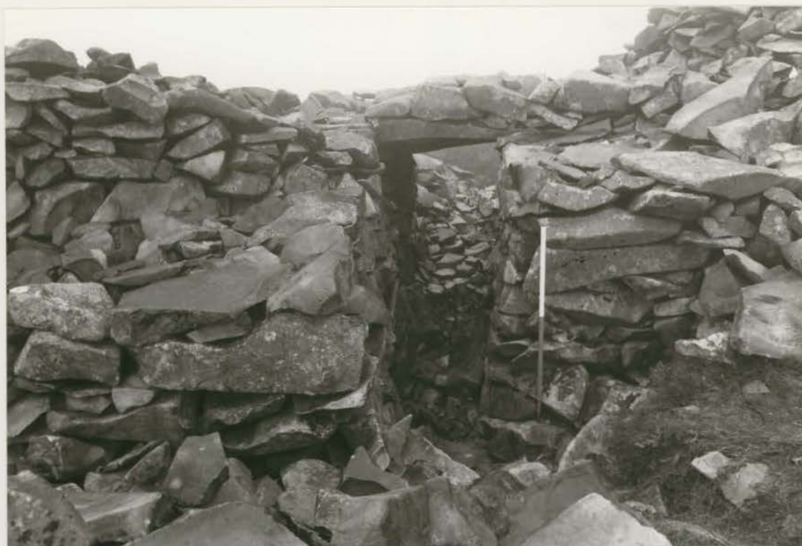
Plate 119. N postern after re-roofing, looking N (G1022/023/28).