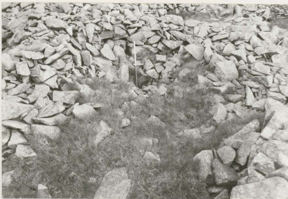
Plate 62. Hut 87: interior and E corner before conservation, looking E (G1022/004/17).