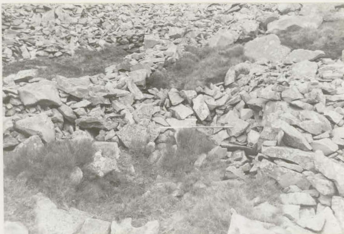
Plate 47. E end of hut 73 before conservation, looking E (G1022/002/12A).