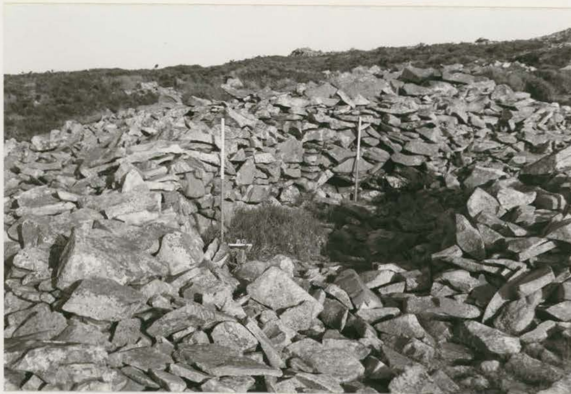
Plate 71. Hut 89: N wall before conservation, looking NE (G1022/004/07).