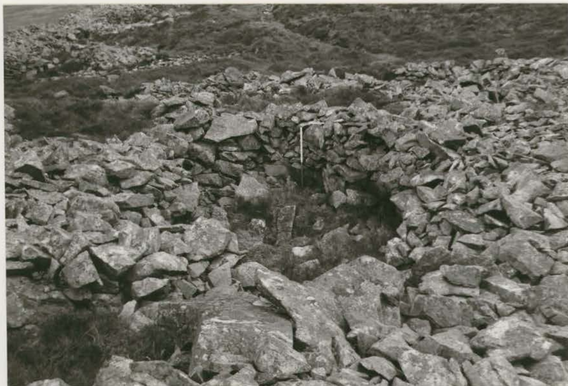
Plate 28. Hut 92 before conservation, looking SW (G1022/001/34).