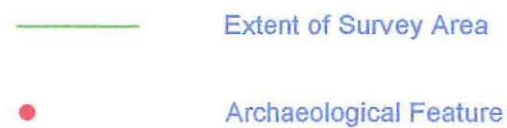
Figure 1: Glascwm, Rhulen and Llanbedr Hills

Based upon the Ordnance Survey mapping with the permission of the Controller of Her Majesty's Stationary Office. Crown Copyright Unauthorised reproduction infringes Crown Copyright and may lead to prosecution or civil proceedings. Powys County Council Licence number LA09016L, 1997