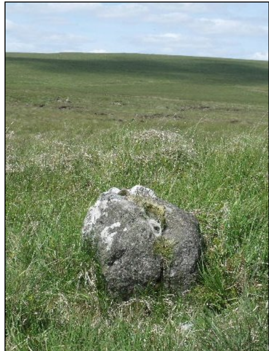
Fig. 4 Stone 2 from the east-south-east.