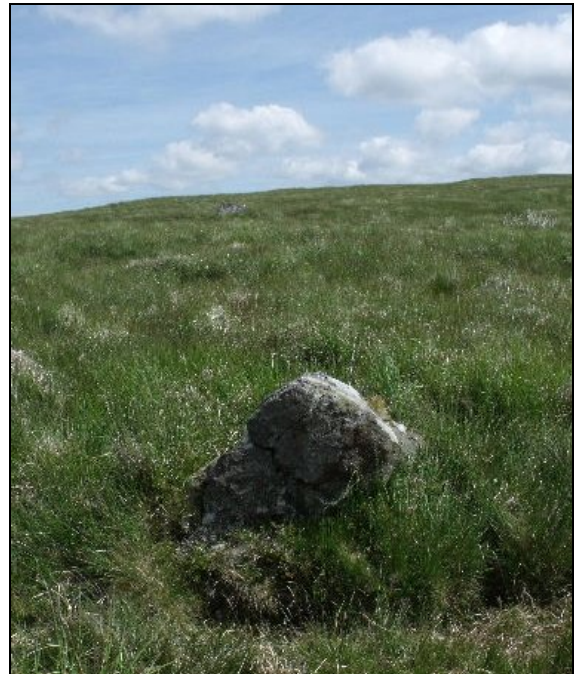
Fig. 6 Stone 4 from the south-west.

Stone 4: A small upright slab aligned on a bearing of 60^{\circ} and measuring 0.7m long, 0.6 high and 0.35m thick.