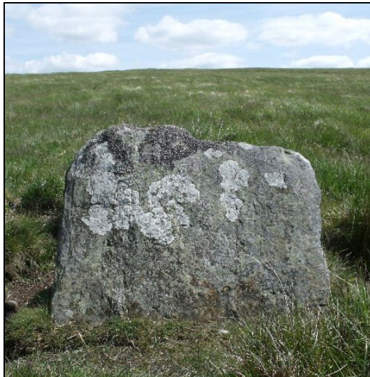
Fig. 3 Stone 1 from the west-south-west.

Stone 2: A small upright stone aligned on a bearing of 50^{\circ} and measuring 0.45m long, 0.45 high and 0.28m thick.