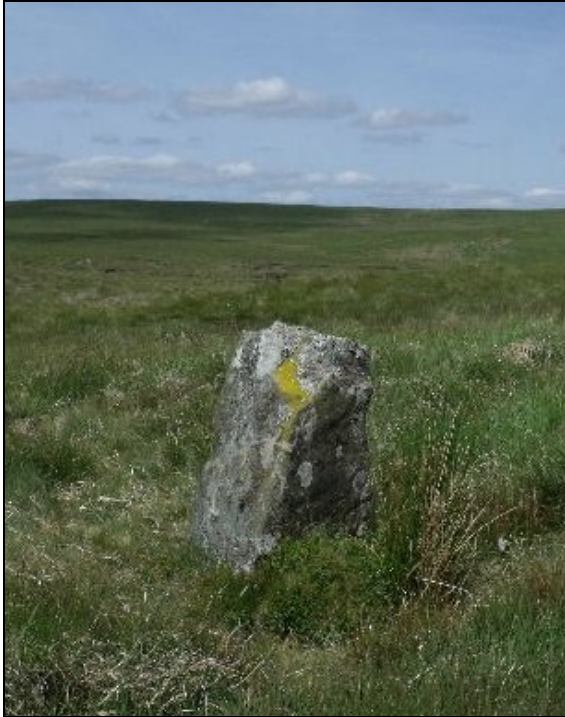
Fig. 5 Stone 3 from the east-south-east.

Stone 3: An upright stone aligned on a bearing of 90^{\circ} and measuring 0.45m long, 0.75 high and 0.3m thick.