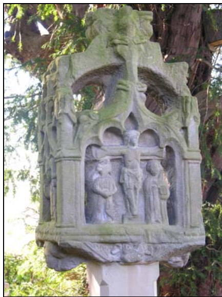
Tremeirchion crosshead from the east

The continued presence of the most significant part of the cross, the crosshead, would have been more of an issue after the Reformation. In addition to those that have survived as integral elements of complete crosses such as Derwen, there are a number of other heads which remain. Outstanding in this respect is the Tremeirchion crosshead (or tabernacle), now re-erected in the churchyard, but there