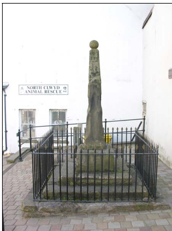
The market cross at Denbigh

Town and market crosses have gradually been dispensed with over the centuries. As their functions dissipated so they became an obstacle that needed to be removed. Caerwys illustrates this well. There is a tradition that a cross stood at the centre of the village where the two main streets intersected. By the 18 th century this had gone and had been replaced by a tree, if an estate map of the time is to be trusted. Local tradition almost maintained, however that Elizabeth I had stood here in 1568 when she declared Caerwys to be the 'home of the Eisteddfod'. By the 20 th century there was a lamp post on the spot, but in 1963, seen as a traffic hazard and in the way of a sewage scheme, it was removed, together with the stone base which may have been a medieval survival. Flint had a churchyard cross on which attention has focused in the past, but it is possible that Speed's drawing of the market cross has gone unrecognised, because his engraver misunderstood the depiction on the surveyor's working drawing.