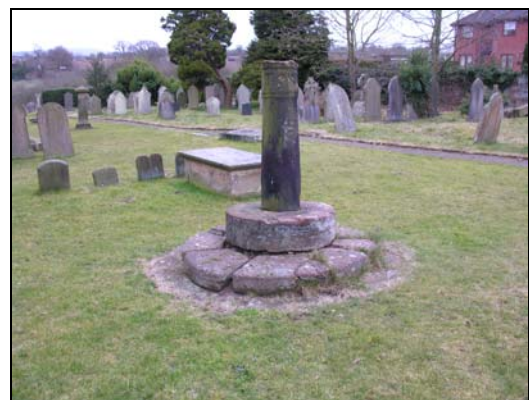
Holt cross base