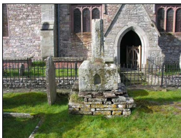
Llangattock cross base

In southern Powys no complete churchyard cross remains, and the crossheads are non-existent. Llanfeugan has most of its shaft surviving, but generally it is the base that remains as at Llangattock and Cwmdy. Both of these exhibit small niches for the pyx, the vessel containing the Host on Palm Sunday.