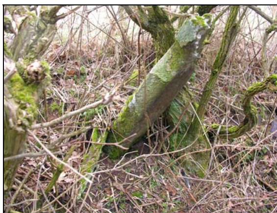
The Pedlar's Cross near Llanigon (Brecs)