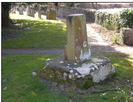
Llanefydd cross base

Denbighshire and adjacent Flintshire have a fine set of churchyard crosses ranging from those that are largely complete such as Derwen (in guardianship), Trelawnyd and Hanmer (both scheduled) to others where only individual elements remain. Cross bases are more likely to have survived the 16 th and 17 th -