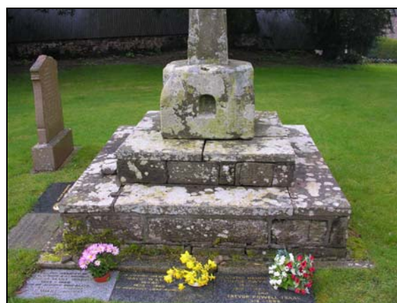
Cwmdy cross base

Deterioration in the condition of the surviving crosses can be established in some instances, but is generally a feature of the 19 th century rather than more recently. Cilcain cross shaft is now virtually half the height it was in the late 19 th century when Owen measured it, while Llanelidan churchyard cross, having survived the vicissitudes of the 16 th and 17 th centuries was taken down by order of the vicar around the 1830s.