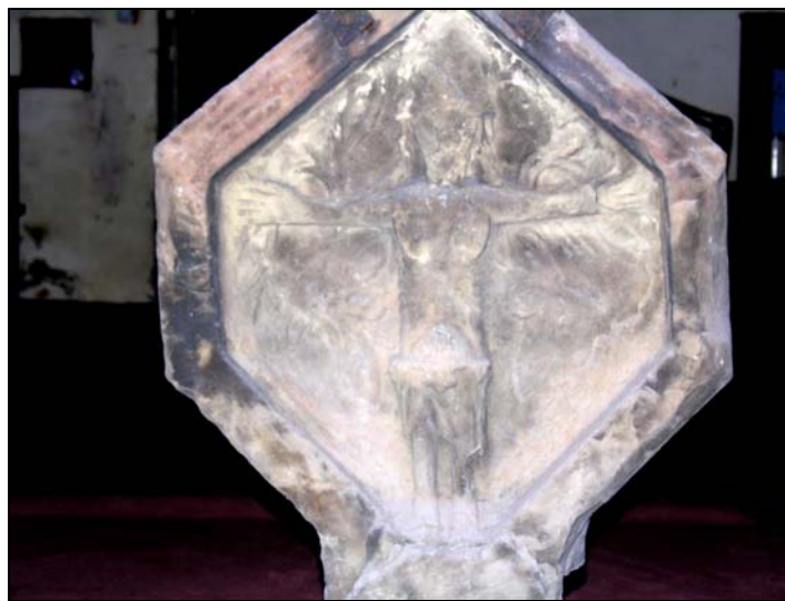
Llanynys crosshead with crucifixion

The earliest post-Conquest cross in the region is probably that at Corwen which has been attributed to the 12 th century, but most of those that can be dated, usually on the basis of their form and decoration, are likely to be later, from the 14 th or 15 th centuries. An exception seems to be the lozenge-shaped stone now housed in Llanynys church in the Vale of Clwyd, but formerly in the churchyard, which has traditionally been thought to be the grave marker of a local, 14 th -century bishop, an interpretation no doubt strengthened by the clas function of Llanynys. Peter Lord, however, seems to take it for granted that the Llanynys stone is a churchyard crosshead of later 14 th -century date and this seems to be an acceptable alternative, not least on iconographic grounds, a comparable crosshead appearing in the churchyard at Milton in Yorkshire (Lord 2003, 111, 155; Vallance 1920, 160).