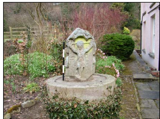
Crosshead from Denbigh Friary