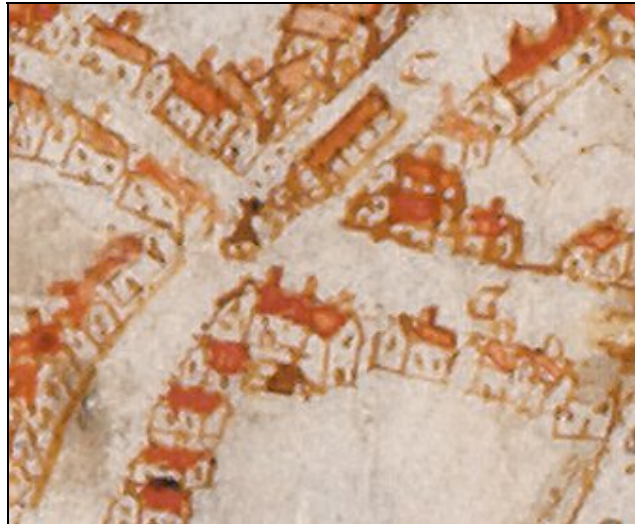
Welshpool town cross as depicted by Humfrey Bleaze in 1629

Early maps are also more likely to depict crosses than later ones. Thus many of the maps used by Whyte (2009) are of 16 th and 17 th -century date. It is a reflection of the continuing but waning symbolism and importance of crosses that in the centuries immediately after the Reformation crosses could still be represented on maps as markers, guides and the like, but later they became superfluous. In Wales it is Speed's detailed town maps showing market crosses which are informative, together with less common, contemporary urban maps such as that for Welshpool with its depiction of the town cross (Silvester 2008). Later maps rarely show such features.