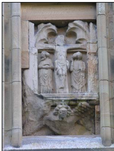
The Halkyn crucifixion

is also the crucifixion plaque from Halkyn which was immured in the new, Victorian church, and others. The removal of crossheads for safekeeping in the past was not a rare event. To Tremeirchion we can add the case of the Denbigh Carmelite Friary Cross which was taken to Dolhyfryd, a gentry