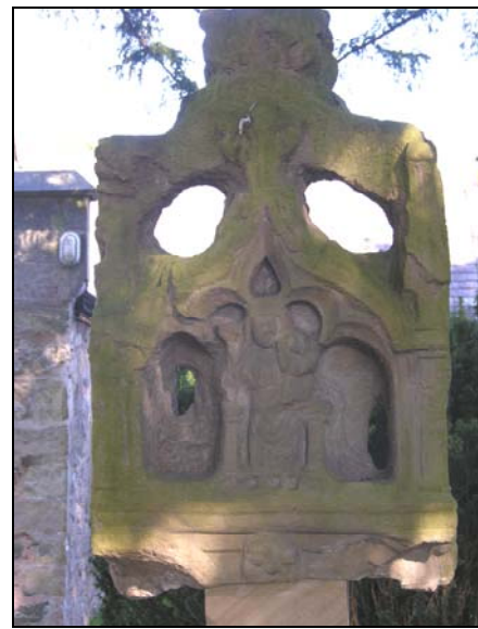
Tremeirchion crosshead from the west

is also the crucifixion plaque from Halkyn which was immured in the new, Victorian church, and others. The removal of crossheads for safekeeping in the past was not a rare event. To Tremeirchion we can add the case of the Denbigh Carmelite Friary Cross which was taken to Dolhyfryd, a gentry