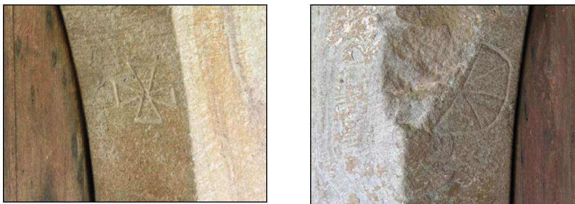
Consecration crosses on the springers of the south door of Llanfilo Church (Brecs)

Up to 24 consecration crosses might have been incorporated into a newly founded church in the medieval era. Few seem to survive in east Wales or if they do they are frequently overlooked, and because they are relatively minor features of the range of church features, they were not specifically differentiated during the churches surveys in the 1990s.