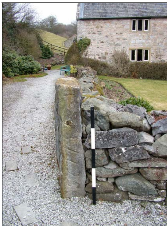
The Maes-y-groes cross in Cilcain

In a less obviously religious context, the cross base at Croes Farm to the south-west of Gresford has been claimed as a wayside cross, even though there is uncertainty as to its original location. Much the same is true of Croes Eneurys (PRN 101539), the lost Croes Gwenhwyvar Cross (PRN 101188), Croes y Beddau Cross (PRN 101178) and the Llwyn y Bedd Cross (PRN 102475), also seemingly lost. But in all these cases the term 'wayside cross' has almost certainly been applied within the record in a generic sense, because the cross lies close to a road which may or may not have medieval antecedents.